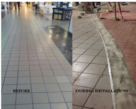
BEFORE DURING INSTALLATION