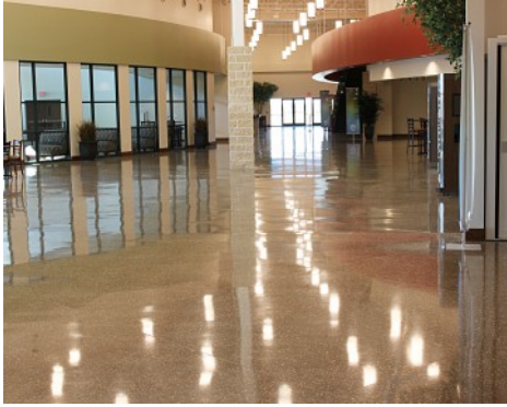
Prestonwood Baptist Church - Bomanite Custom Polished Concrete - Renaissance System