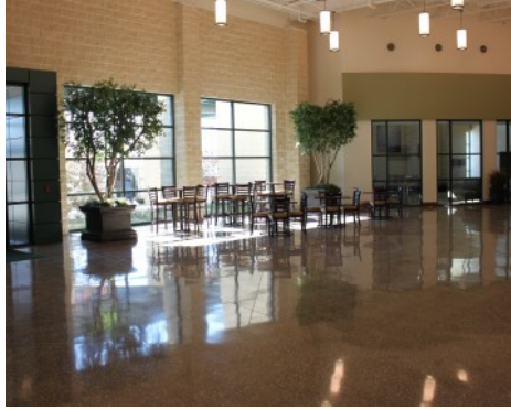
Prestonwood Baptist Church - Bomanite Custom Polished Concrete - Renaissance System