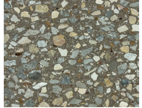
Prestonwood Baptist Church - Bomanite Custom Polished Concrete - Renaissance System