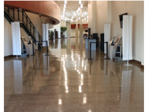
Prestonwood Baptist Church - Bomanite Custom Polished Concrete - Renaissance System