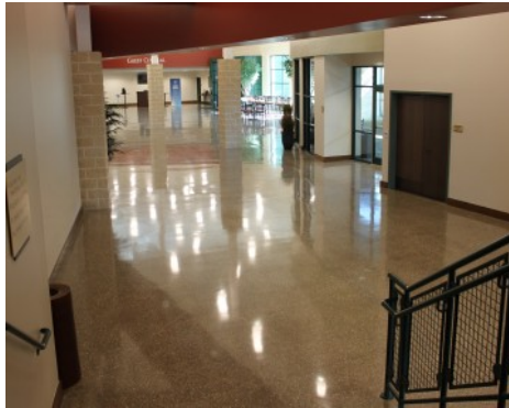
Prestonwood Baptist Church - Bomanite Custom Polished Concrete - Renaissance System