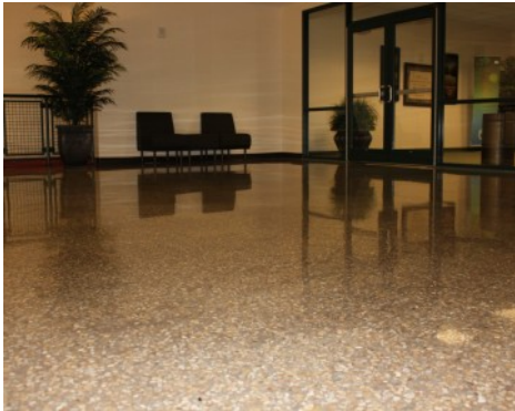
Prestonwood Baptist Church - Bomanite Custom Polished Concrete - Renaissance System