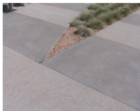
Powehouse Plaza - Bomanite Sandscape Texture