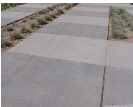
Powehouse Plaza - Bomanite Sandscape Texture