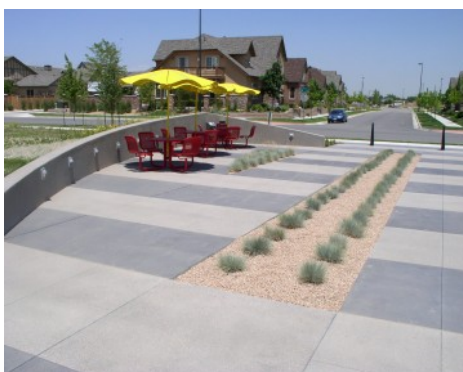
Powehouse Plaza - Bomanite Sandscape Texture