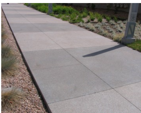
Powehouse Plaza - Bomanite Sandscape Texture