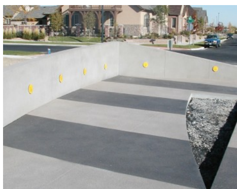
Powehouse Plaza - Bomanite Sandscape Texture