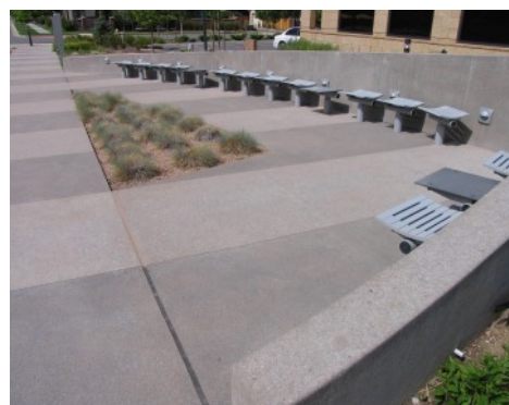
Powehouse Plaza - Bomanite Sandscape Texture