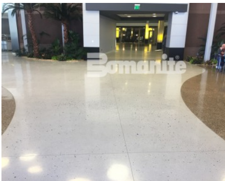
Infinite Campus Cafeteria - Bomanite Custom Polished Systems; Modena Monolithic and Renaissance Deep Grind