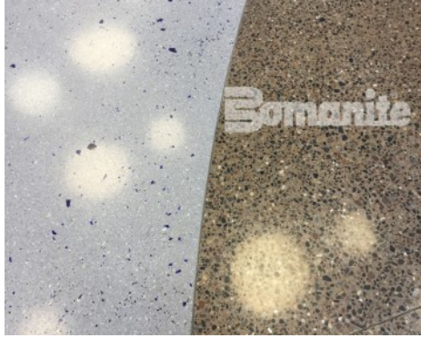
Infinite Campus Cafeteria - Bomanite Custom Polished Systems; Modena Monolithic and Renaissance Deep Grind