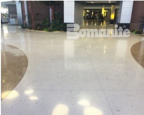
Infinite Campus Cafeteria - Bomanite Custom Polished Systems; Modena Monolithic and Renaissance Deep Grind