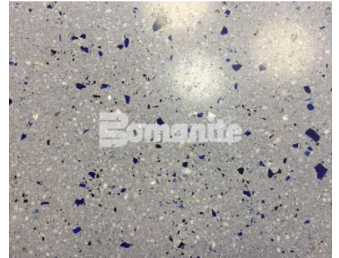
Infinite Campus Cafeteria - Bomanite Custom Polished Systems; Modena Monolithic Close Up