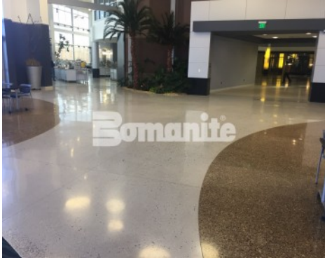
Infinite Campus Cafeteria - Bomanite Custom Polished Systems; Modena Monolithic and Renaissance

INFINITE CAMPUS (MODENA MONOLITHIC, RENAISSANCE)