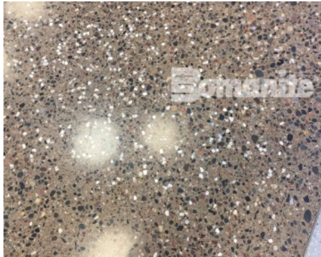
Infinite Campus Cafeteria - Bomanite Custom Polished Systems; Renaissance Deep Grind Close Up