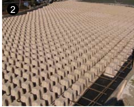
Bomanite Grasscrete Molded Pulp Former Installation