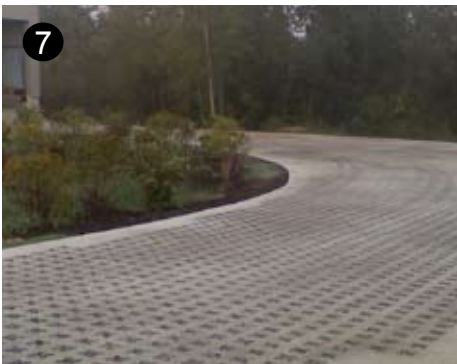
Installed Bomanite Grasscrete Stone Filled Void System