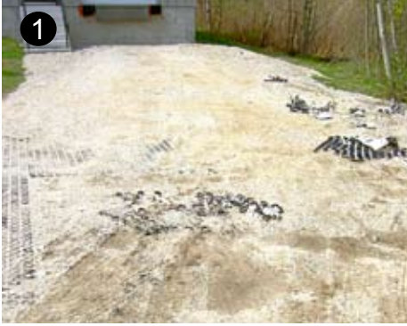
Failed Gravelpave2 Installed System