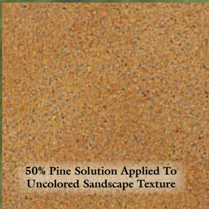
50% Pine Solution Applied To Uncolored Sandstone Texture