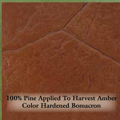
100% Pine Applied To Harvest Amber Color Hardened Bomacron