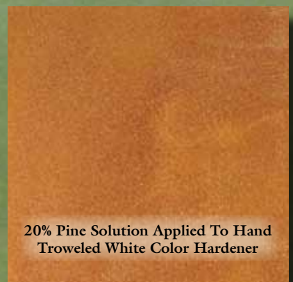
20% Pine Solution Applied To Hand Troweled White Color Hardener