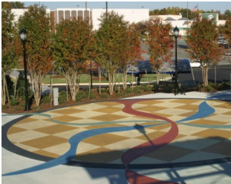
Eastland Transit Center Finished Graphics