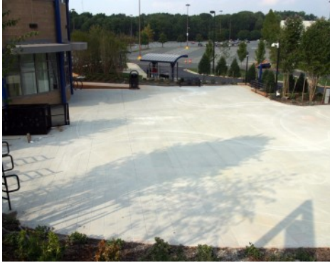
Eastland Entry Surface Prep