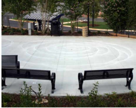
Eastland Entry Surface Prep