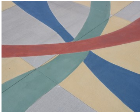
Eastland Transit Center Close Up Graphics