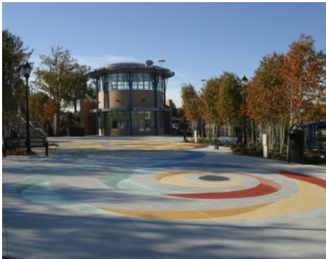
Eastland Transit Center Exterior Graphics