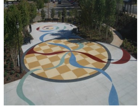
Eastland Transit Center Finished Graphics