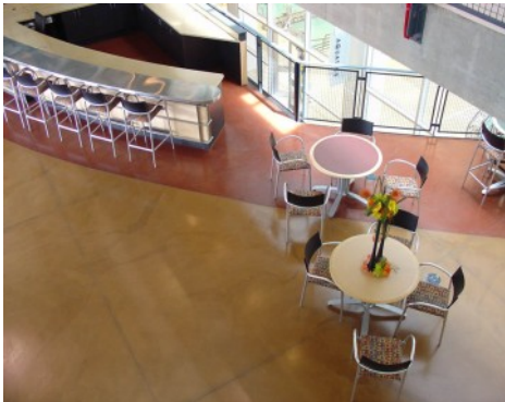
University of Alabama at Birmingham Recreation Center - Bomanite Micro-Top