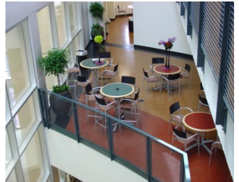
University of Alabama at Birmingham Recreation Center - Bomanite Micro-Top