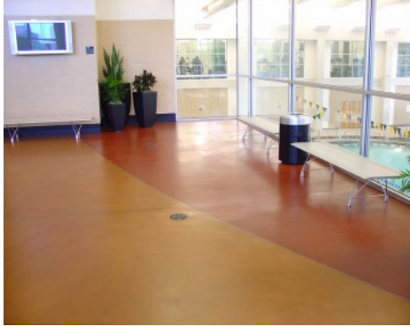
University of Alabama at Birmingham Recreation Center - Bomanite Micro-Top