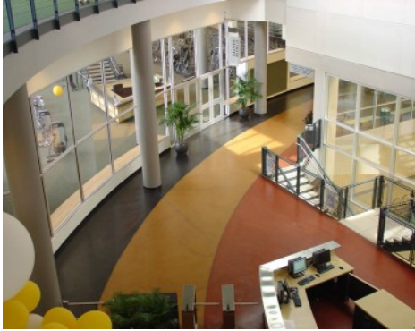
University of Alabama at Birmingham Recreation Center - Bomanite Micro-Top