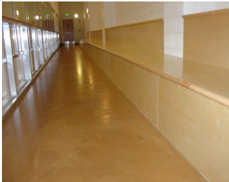
University of Alabama at Birmingham Recreation Center - Bomanite Micro-Top