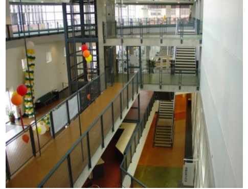
University of Alabama at Birmingham Recreation Center - Bomanite Micro-Top