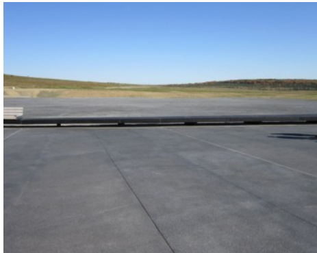
Flight 93 Memorial - Bomanite Revealed