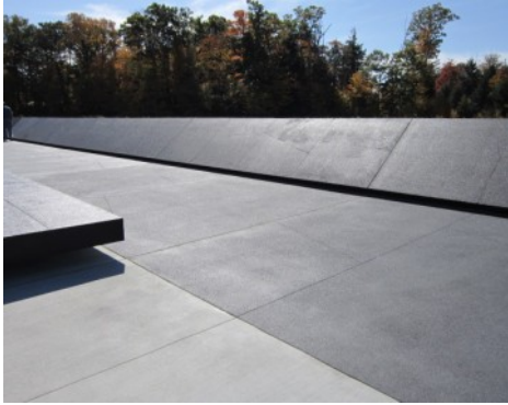
Flight 93 Memorial - Bomanite Revealed