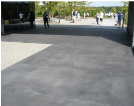
Flight 93 Memorial - Bomanite Revealed