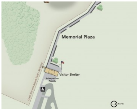
Flight 93 Memorial Plaza Map