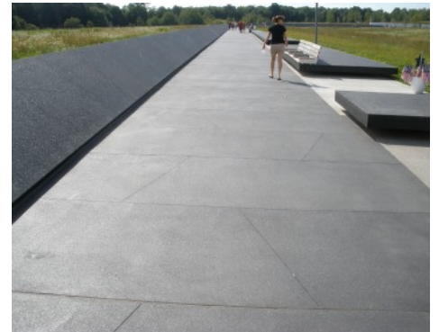
Flight 93 Memorial - Bomanite Revealed