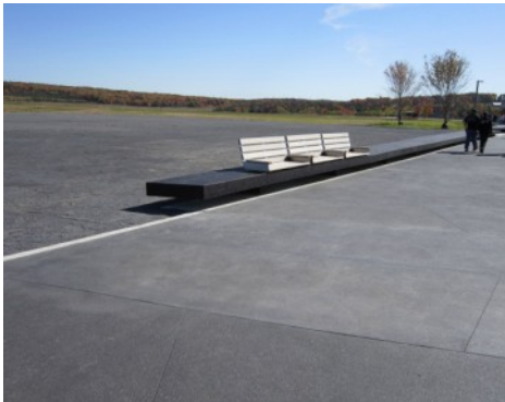
Flight 93 Memorial - Bomanite Revealed