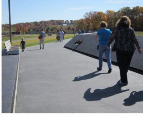
Flight 93 Memorial - Bomanite Revealed