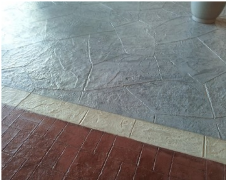
Valley Fair Mall - Renovation Bomanite Thin-Set; Basketweave Used Brick, Random Slate, English Slate Texture