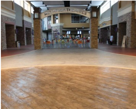
Valley Fair Mall - Renovation Bomanite Thin-Set; Basketweave Used Brick, Random Slate, English Slate Texture, Boardwalk