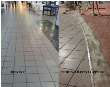
Valley Fair Mall - Before Renovation and during installation