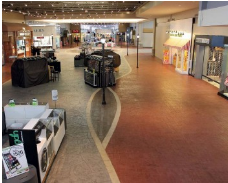
Valley Fair Mall - Renovation Bomanite Thin-Set; Basketweave Used Brick, Random Slate, English Slate Texture, Boardwalk