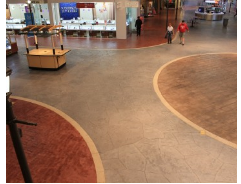
Valley Fair Mall - Renovation Bomanite Thin-Set; Basketweave Used Brick, Random Slate, English Slate Texture, Boardwalk