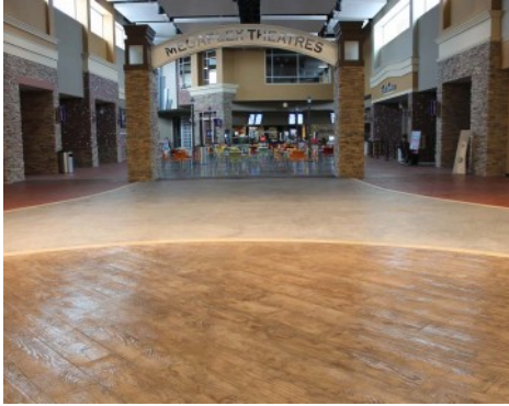
Valley Fair Mall - Renovation Bomanite Thin-Set; Basketweave Used Brick, Random Slate, English Slate Texture, Boardwalk