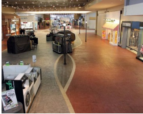
Valley Fair Mall - Renovation Bomanite Thin-Set; Basketweave Used Brick, Random Slate, English Slate Texture, Boardwalk