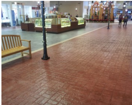
Valley Fair Mall - Renovation Bomanite Thin-Set; Basketweave Used Brick