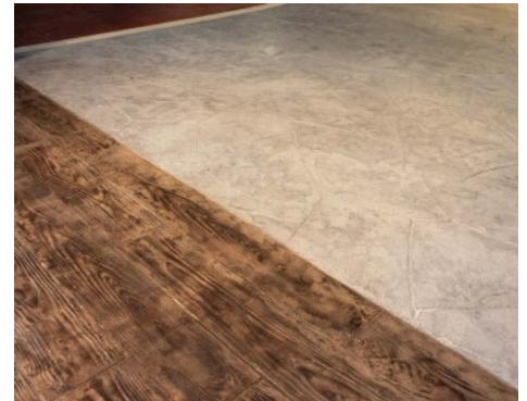
Valley Fair Mall - Renovation Bomanite Thin-Set; Boardwalk, Random Slate,