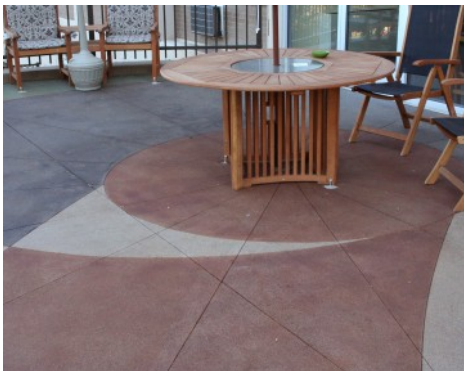
Nan McKay Public Housing - Bomanite Sandstone and Chemical Stain