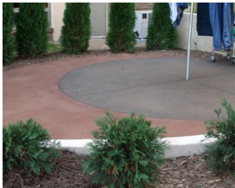
Nan McKay Public Housing - Bomanite Sandstone and Chemical Stain