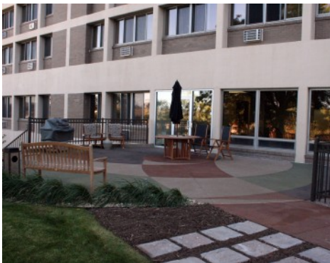
Nan McKay Public Housing - Bomanite Sandstone and Chemical Stain