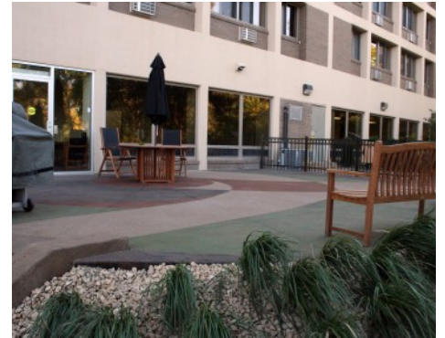
Nan McKay Public Housing - Bomanite Sandstone and Chemical Stain