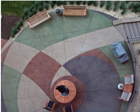
Nan McKay Public Housing - Bomanite Sandstone and Chemical Stain