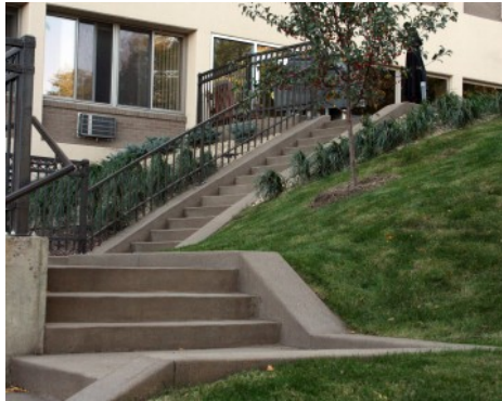
Nan McKay Public Housing - Bomanite Sandstone and Chemical Stain