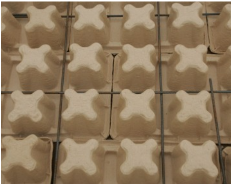
Grasscrete Molded Pulp Former Close Up