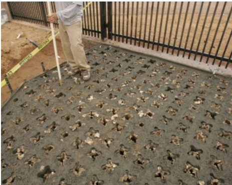
Grasscrete - Void Removal