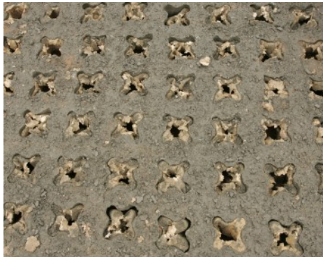
Grasscrete - Void Removal