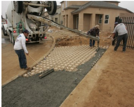
Grasscrete - Concrete Pour