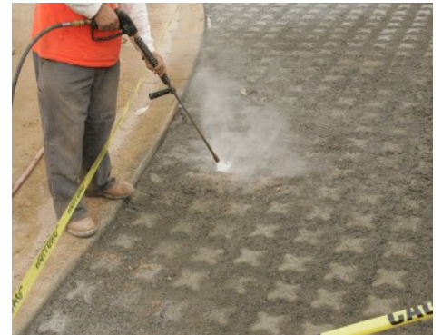
Grasscrete - Void Removal