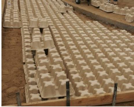
Grasscrete - Laying Molded Pulp Former