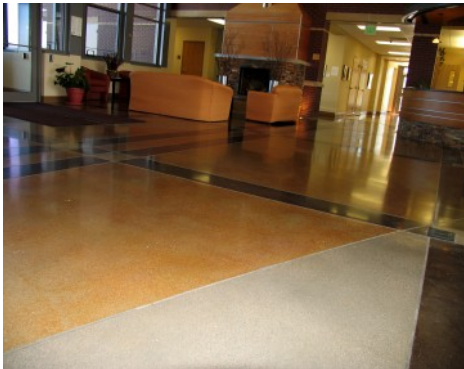
Colorado Mountain College - Bomanite Custom Polishing Concrete Floors - Patene Teres