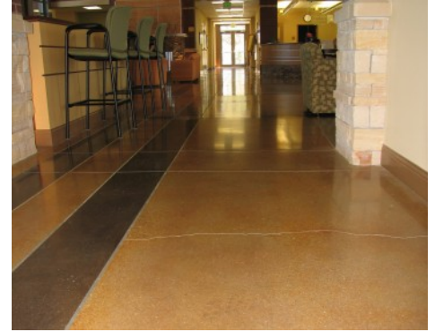
Colorado Mountain College - Bomanite Custom Polishing Concrete Floors - Patene Teres