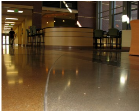
Colorado Mountain College - Bomanite Custom Polishing Concrete Floors - Patene Teres