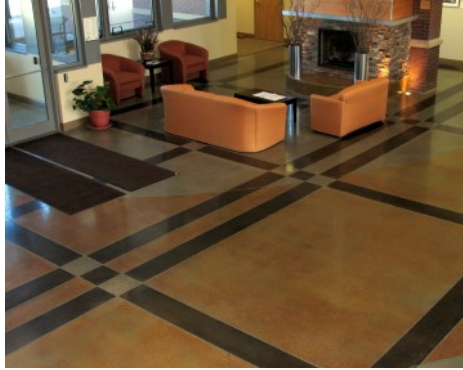
Colorado Mountain College - Bomanite Custom Polishing Concrete Floors - Patene Teres