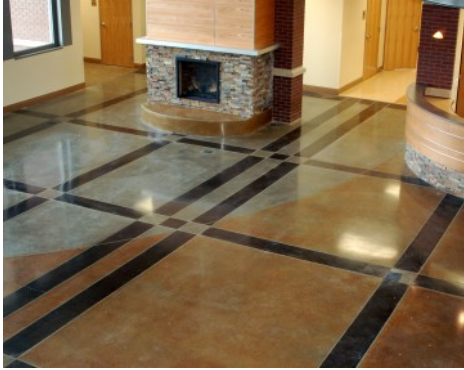
Colorado Mountain College - Bomanite Custom Polishing Concrete Floors - Patene Teres