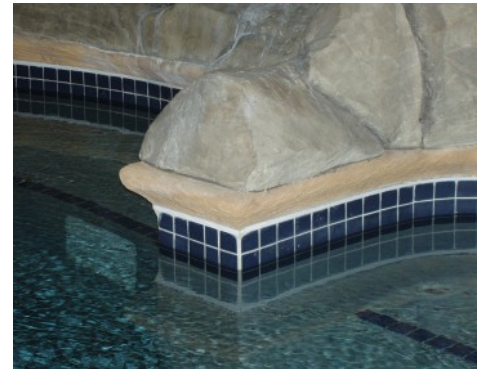
Grand Rios Waterpark - Bomanite Imprinted Concrete Systems