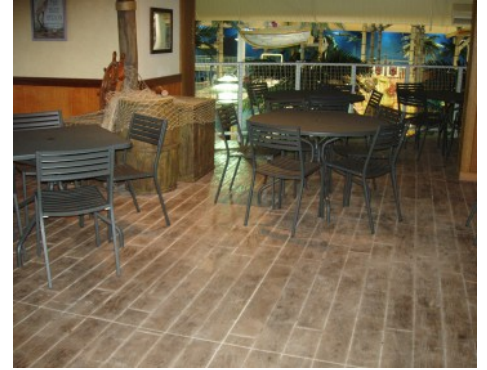
Grand Rios Waterpark - Bomanite Imprinted Concrete Systems