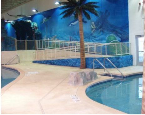
Grand Rios Waterpark - Bomanite Imprinted Concrete Systems