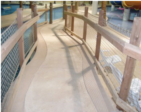
Grand Rios Waterpark - Bomanite Imprinted Concrete Systems