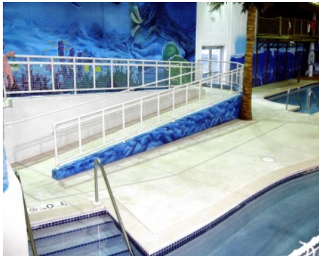
Grand Rios Waterpark - Bomanite Imprinted Concrete Systems