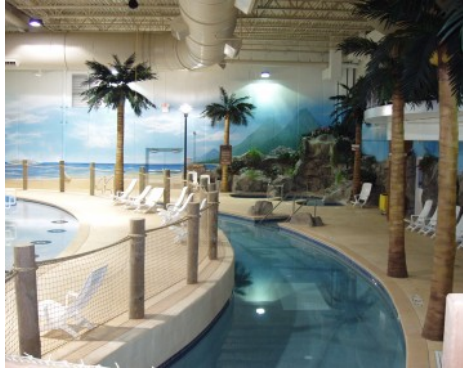
Grand Rios Waterpark - Bomanite Imprinted Concrete Systems