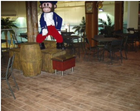
Grand Rios Waterpark - Bomanite Imprinted Concrete Systems