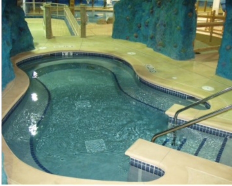
Grand Rios Waterpark - Bomanite Imprinted Concrete Systems