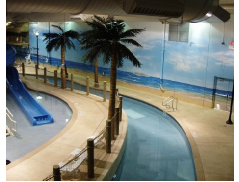
Grand Rios Waterpark - Bomanite Imprinted Concrete Systems