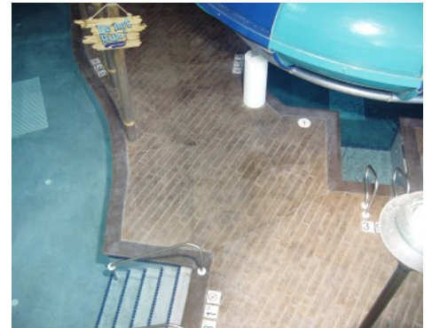
Grand Rios Waterpark - Bomanite Imprinted Concrete Systems