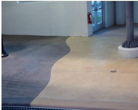
Grand Rios Waterpark - Bomanite Imprinted Concrete Systems