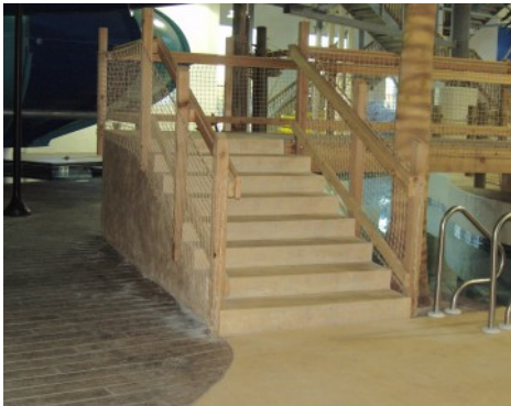
Grand Rios Waterpark - Bomanite Imprinted Concrete Systems