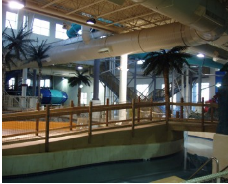
Grand Rios Waterpark - Bomanite Imprinted Concrete Systems