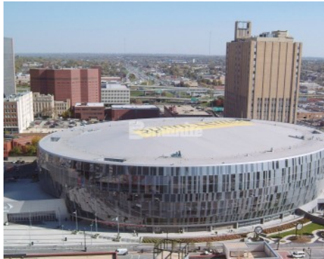
Sprint Center Moon Plaza - Bomanite Imprint Systems Custom La Paz Random Stone Pattern with Bomanite Sandscape Texture Exposed Aggregate System