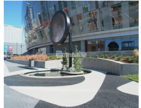
Sprint Center Moon Plaza - Bomanite Imprint Systems Custom La Paz Random Stone Pattern with Bomanite Sandscape Texture Exposed Aggregate System