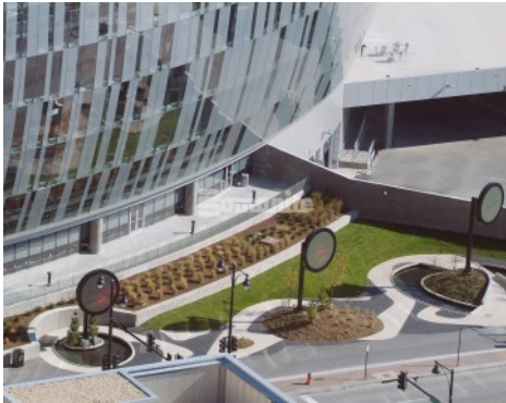
Sprint Center Moon Plaza - Bomanite Imprint Systems Custom La Paz Random Stone Pattern with Bomanite Sandscape Texture Exposed Aggregate System