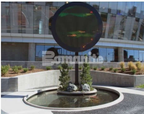
Sprint Center Moon Plaza - Bomanite Imprint Systems Custom La Paz Random Stone Pattern with Bomanite Sandscape Texture Exposed Aggregate System