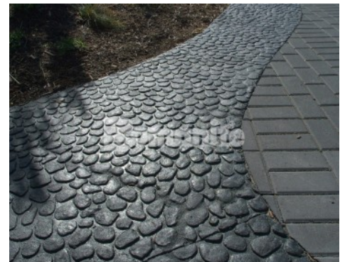
Sprint Center Moon Plaza - Bomanite Imprint Systems Custom La Paz Random Stone Pattern with Bomanite Sandscape Texture Exposed Aggregate System