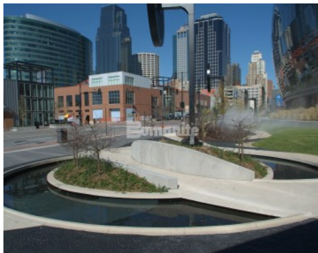
Sprint Center Moon Plaza - Bomanite Imprint Systems Custom La Paz Random Stone Pattern with Bomanite Sandscape Texture Exposed Aggregate System