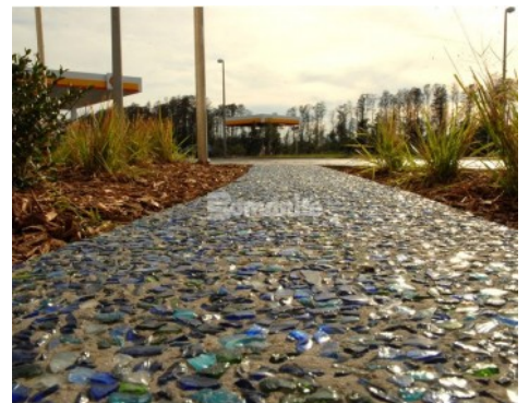
Florida Turnpike Canoe Creek - Bomanite Exposed Aggregate Revealed