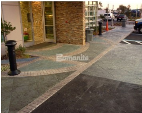
Florida Turnpike Canoe Creek - Bomanite Imprint Systems; Slate Texture, Soldier Course Brick, River Rock