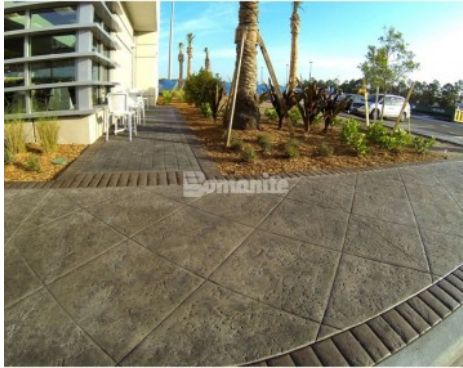
Florida Turnpike Ft Drum - Bomanite Imprint Systems; Coquina Texture, Soldier Course Brick, 6 x 6 Granite Setts