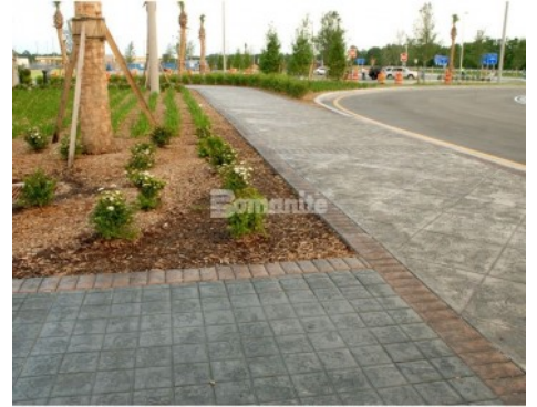
Florida Turnpike Ft Drum - Bomanite Imprint Systems; Coquina Texture, Soldier Course Brick, 6 x 6 Granite Setts