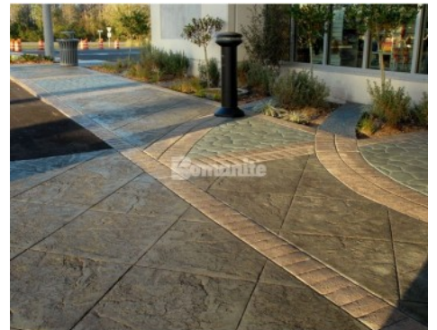
Florida Turnpike Canoe Creek - Bomanite Imprint Systems; Slate Texture, Soldier Course Brick, River Rock