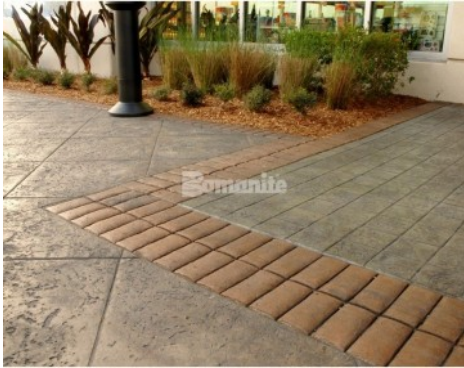
Florida Turnpike Ft Drum - Bomanite Imprint Systems; Soldier Course Brick, Coquina Texture, 6 x 6 Granite Setts