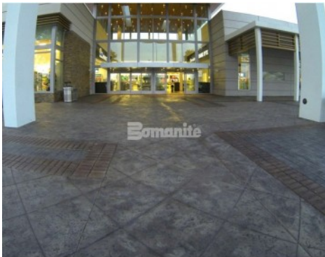
Florida Turnpike Ft Drum - Bomanite Imprint Systems; Coquina Texture, Soldier Course Brick, 6 x 6 Granite Setts