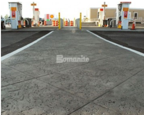
Florida Turnpike - Bomanite Imprint Systems; Coquina Texture, Bomanite Florspartic 100 White