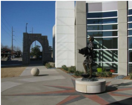
First United Methodist Church - Sandstone Texture with Bomanite Con-Color