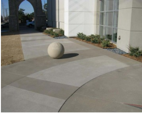
First United Methodist Church - Sandstone Texture with Bomanite Con-Color