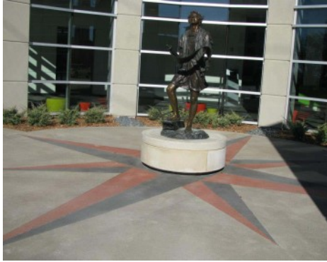
First United Methodist Church - Sandstone Texture with Bomanite Con-Color