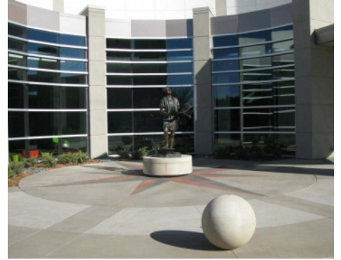
First United Methodist Church - Sandstone Texture with Bomanite Con-Color