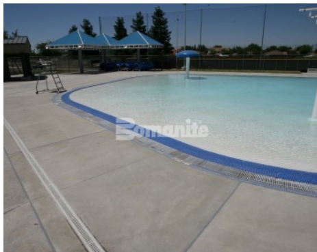
Central East High School Fresno - Bomanite Sandstone Texture Exposed Aggregate Pool Deck