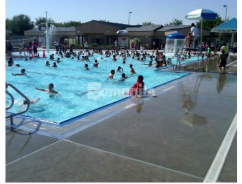
Central East High School Fresno - Bomanite Sandstone Texture Exposed Aggregate Pool Deck