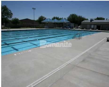
Central East High School Fresno - Bomanite Sandstone Texture Exposed Aggregate Pool Deck