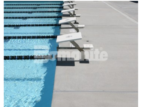
Central East High School Fresno - Bomanite Sandstone Texture Exposed Aggregate Pool Deck