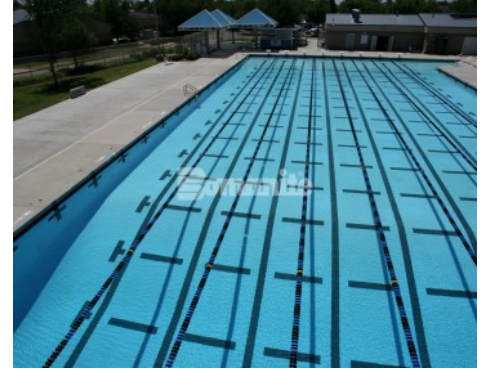
Central East High School Fresno - Bomanite Sandstone Texture Exposed Aggregate Pool Deck