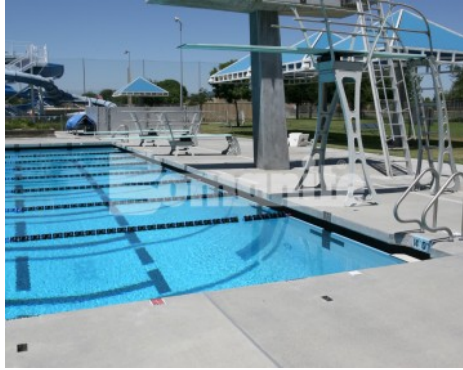
Central East High School Fresno - Bomanite Sandstone Texture Exposed Aggregate Pool Deck