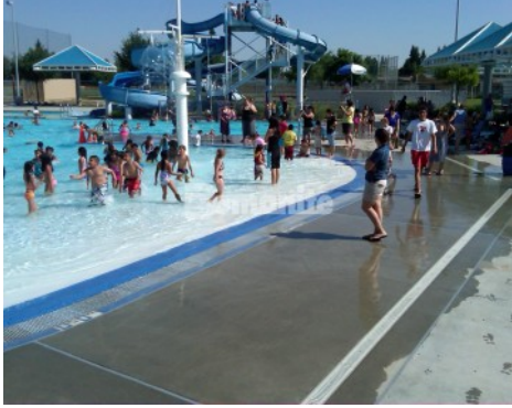
Central East High School Fresno - Bomanite Sandstone Texture Exposed Aggregate Pool Deck