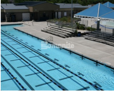
Central East High School Fresno - Bomanite Sandstone Texture Exposed Aggregate Pool Deck