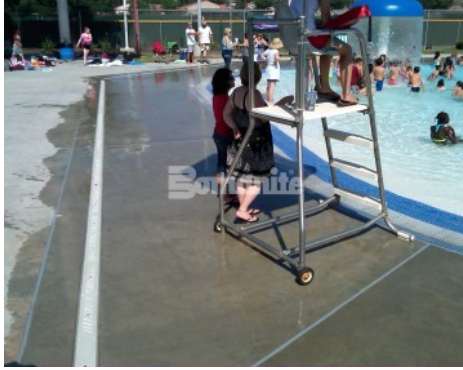
Central East High School Fresno - Bomanite Sandstone Texture Exposed Aggregate Pool Deck