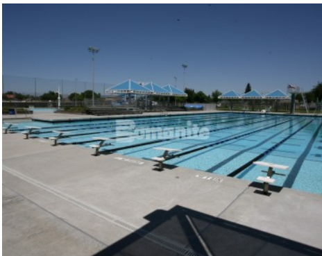
Central East High School Fresno - Bomanite Sandstone Texture Exposed Aggregate Pool Deck