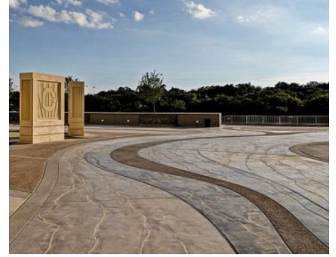
TCU Amon G Carter Stadium -Bomanite Imprint Systems Shifting Sand Pattern