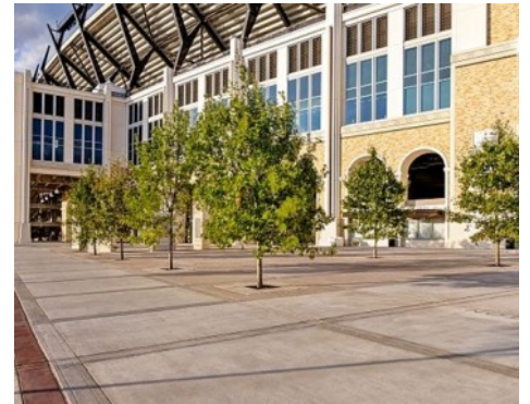
TCU Amon G Carter Stadium -Bomanite SandScape Texture with Bomanite Con-Color