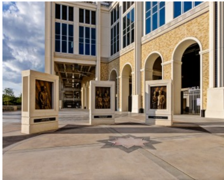
TCU Amon G Carter Stadium -Bomanite SandScape Texture with Bomanite Con-Color