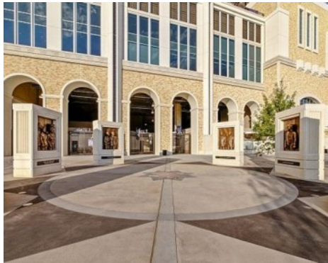
TCU Amon G Carter Stadium -Bomanite SandScape Texture with Bomanite Con-Color