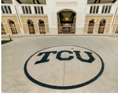
TCU Amon G Carter Stadium -Bomanite SandScape Texture with Bomanite Con-Color