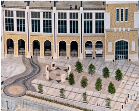
TCU Amon G Carter Stadium - Bomanite Exposed Aggregate Systems Sandstone Texture and Bomanite Imprint Systems