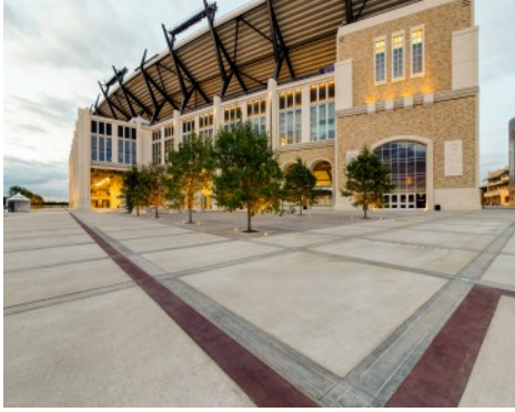
TCU Amon G Carter Stadium -Bomanite SandScape Texture with Bomanite Con-Color