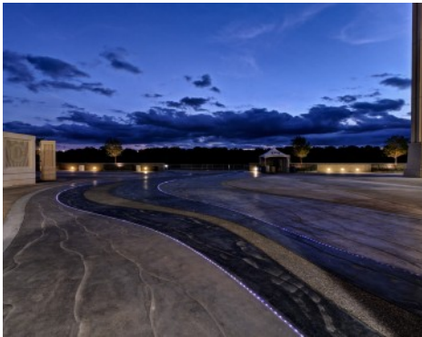
TCU Amon G Carter Stadium -Bomanite Imprint Systems Shifting Sand Pattern