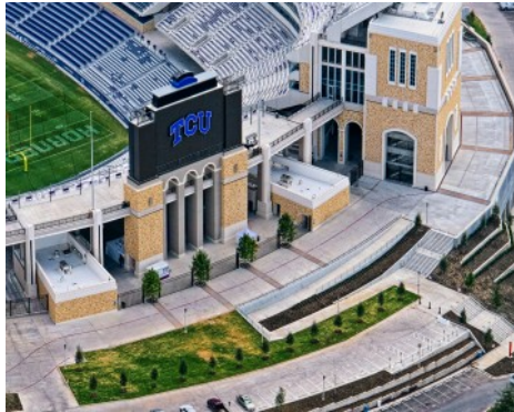
TCU Amon G Carter Stadium - Bomanite Exposed Aggregate Systems Sandstone Texture and Bomanite Imprint Systems