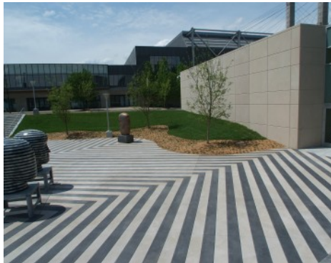
Bartle Hall Ballroom Water Plaza - Sandstone Texture with Bomanite Con-Color