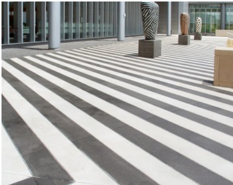
Bartle Hall Ballroom Water Plaza - Sandstone Texture with Bomanite Con-Color