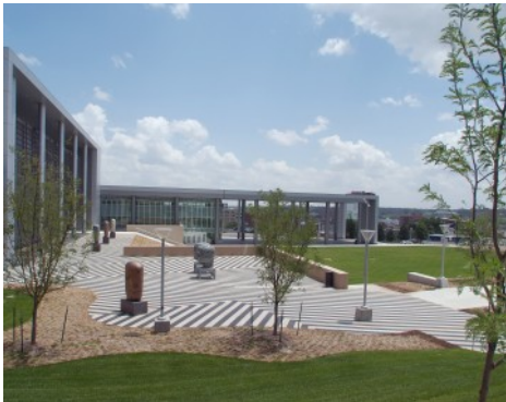
Bartle Hall Ballroom Water Plaza - Sandstone Texture with Bomanite Con-Color