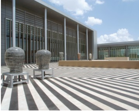
Bartle Hall Ballroom Water Plaza - Sandstone Texture with Bomanite Con-Color