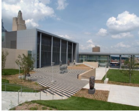
Bartle Hall Ballroom Water Plaza - Sandstone Texture with Bomanite Con-Color