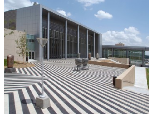
Bartle Hall Ballroom Water Plaza - Sandstone Texture with Bomanite Con-Color