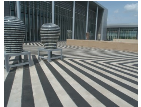
Bartle Hall Ballroom Water Plaza - Sandstone Texture with Bomanite Con-Color