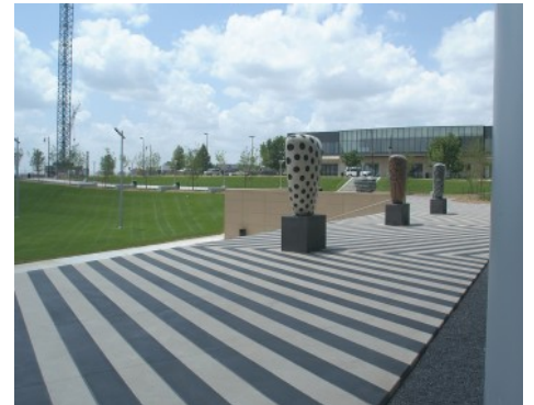
Bartle Hall Ballroom Water Plaza - Sandstone Texture with Bomanite Con-Color