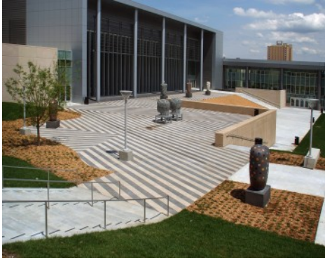
Bartle Hall Ballroom Water Plaza - Sandstone Texture with Bomanite Con-Color