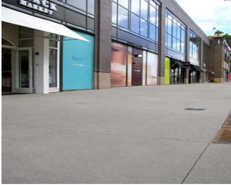
Belmar Development - Sandstone Texture Walkways