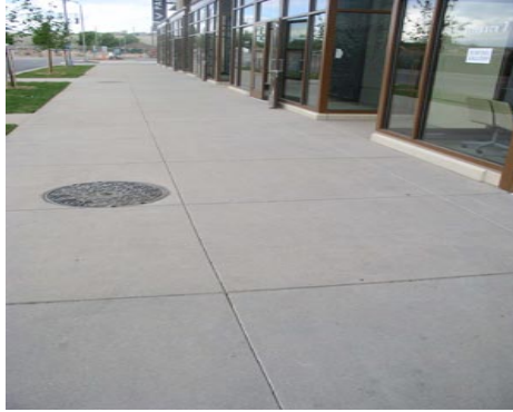
Belmar Development - Sandstone Texture Walkways