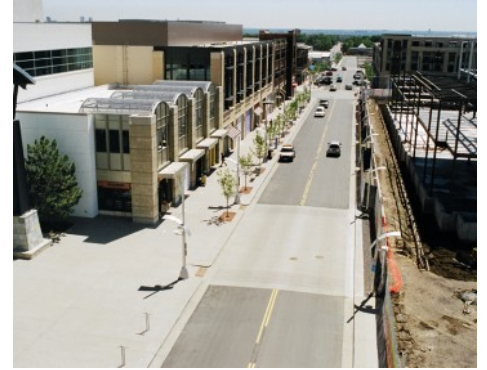
Belmar Development Street Overview - Sandstone Texture Walkways