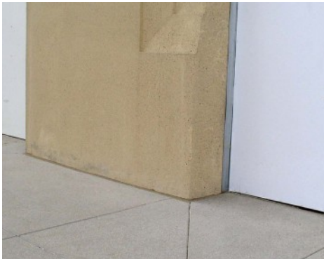
Belmar Development - Sandstone Texture Walkways