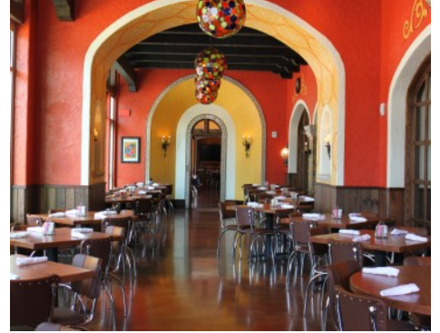
Uncle Julio's Restaurant - Austin Texas Bomanite Chemical Stain