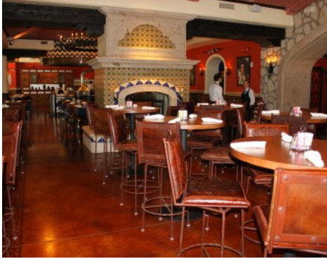
Uncle Julio's Restaurant - Austin Texas Bomanite Chemical Stain