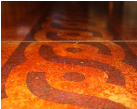
Uncle Julio's Restaurant - Austin Texas Bomanite Chemical Stain and Braided Boarder Stencil