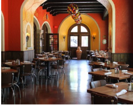
Uncle Julio's Restaurant - Austin Texas Bomanite Chemical Stain