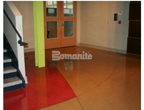
Intermark Office - Bomanite Toppings System Micro-Top Interior Floor