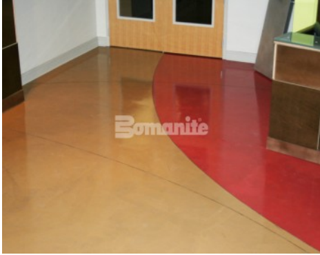
Intermark Office - Bomanite Toppings System Micro-Top Interior Floor