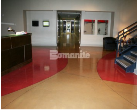
Intermark Office - Bomanite Toppings System Micro-Top Interior Floor