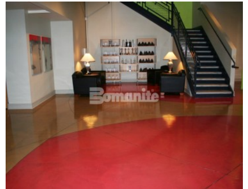
Intermark Office - Bomanite Toppings System Micro-Top Interior Floor