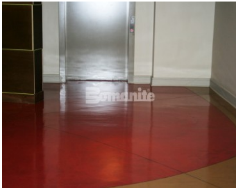
Intermark Office - Bomanite Toppings System Micro-Top Interior Floor