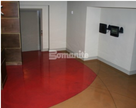
Intermark Office - Bomanite Toppings System Micro-Top Interior Floor