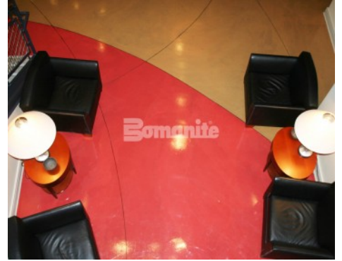
Intermark Office - Bomanite Toppings System Micro-Top Interior Floor