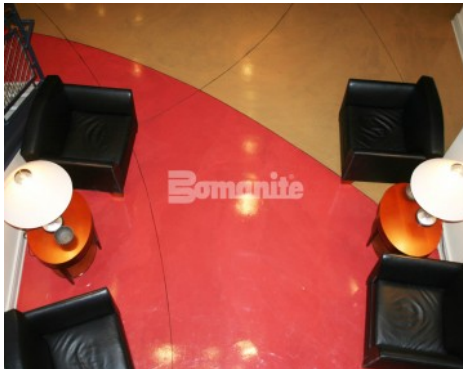
Intermark Office - Bomanite Toppings System Micro-Top Interior Floor