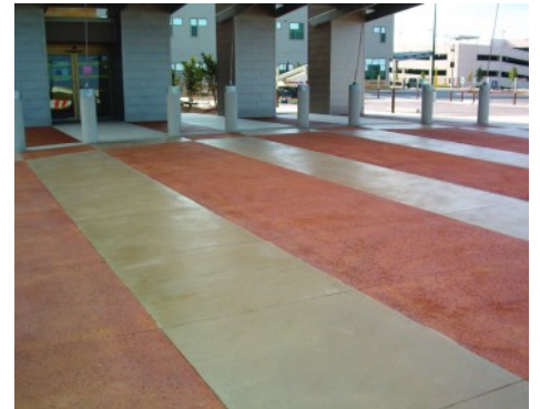
Dell Children's Hospital