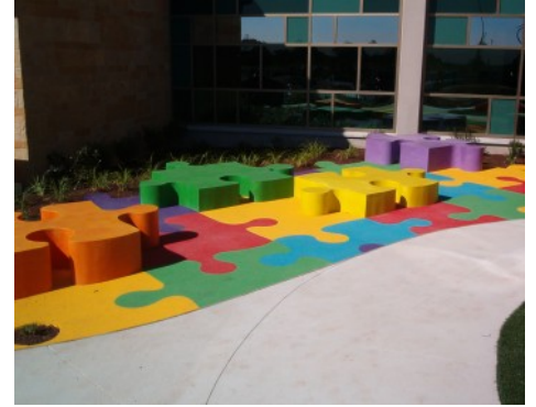
Dell Children's Hospital