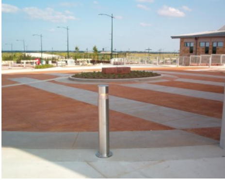
Dell Children's Hospital