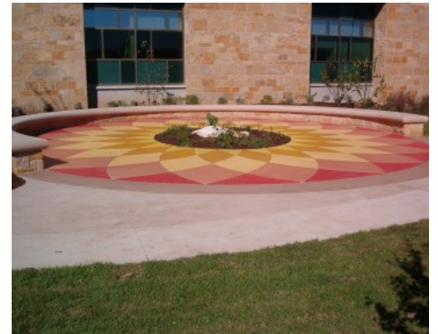
Dell Children's Hospital