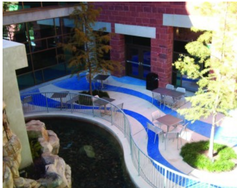
Dell Children's Hospital