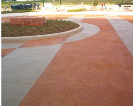
Dell Children's Hospital