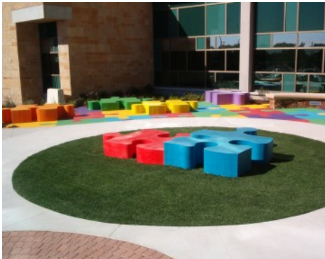
Dell Children's Hospital