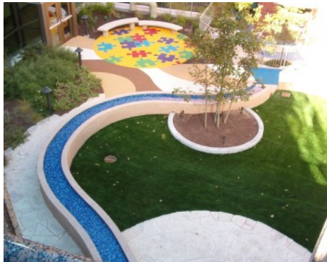
Dell Children's Hospital