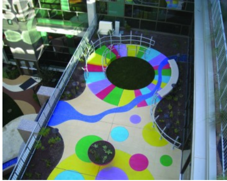
Dell Children's Hospital