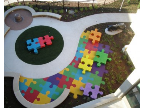
Dell Children's Hospital