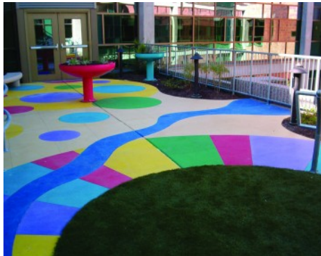
Dell Children's Hospital