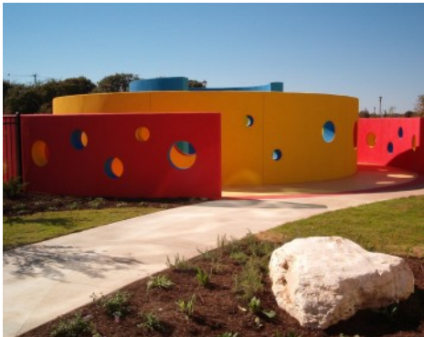
Dell Children's Hospital