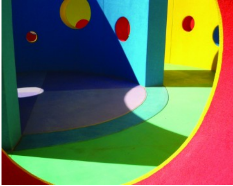
Dell Children's Hospital