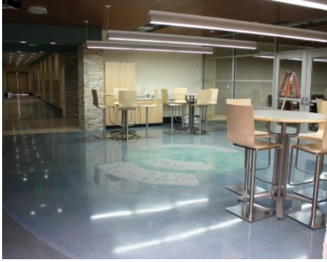
Wyoming Combined Labs - Polished Concrete Dye Patene Teres System