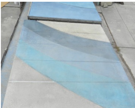
Wyoming Combined Labs - Before Application, Sample Mockup