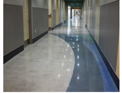
Wyoming Combined Labs - Polished Concrete Dye Patene Teres System