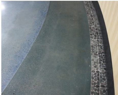
Wyoming Combined Labs - Polished Concrete Dye Patene Teres System