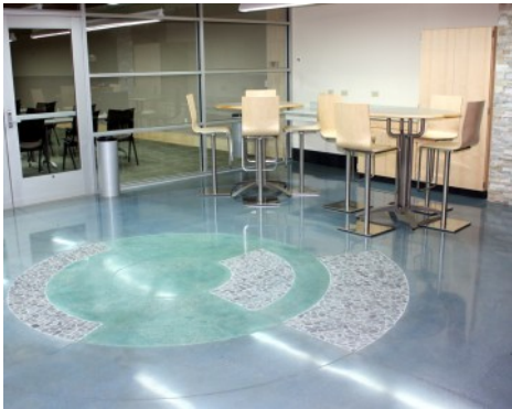
Wyoming Combined Labs - Polished Concrete Dye Patene Teres System