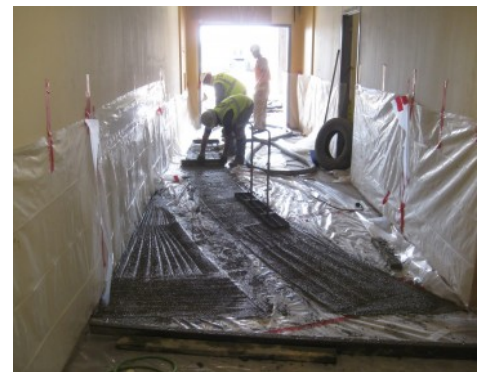
Wyoming Combined Labs - During Installation, Space Constraints