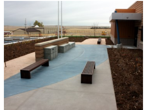
Wyoming Combined Labs - Exterior Sandscaping Walkway