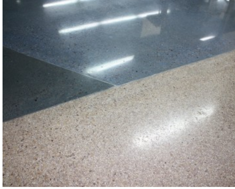
Wyoming Combined Labs - Polished Concrete Dye Patene Teres System