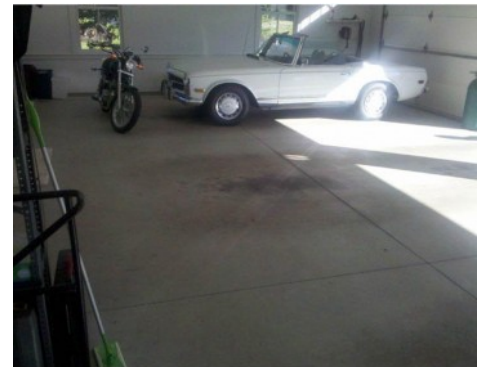
Residential Garage Floor - Before Application