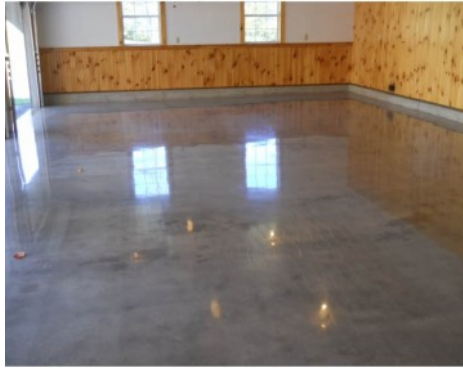
Residential Carriage House Floor - Bomanite Patene Teres Concrete Dye