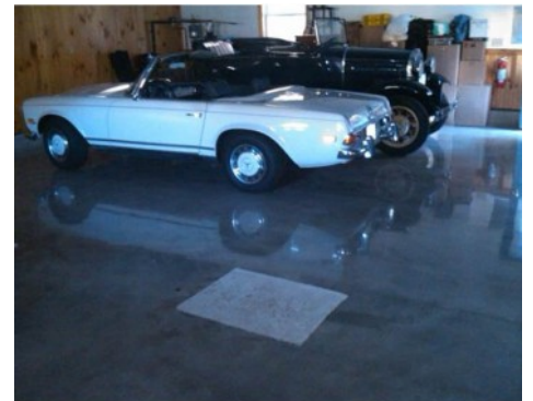
Residential Carriage House Floor - Bomanite Patene Teres Concrete Dye