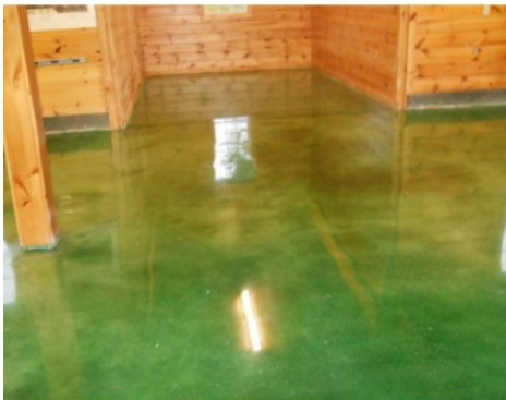
Residential Helicopter Hangar Floor - Bomanite Patene Teres Concrete Dye