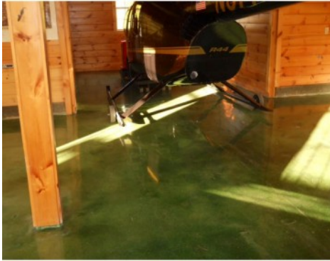
Residential Helicopter Hangar Floor - Bomanite Patene Teres Concrete Dye

PRIVATE RESIDENCE – GARAGE AND HELICOPTER HANGAR