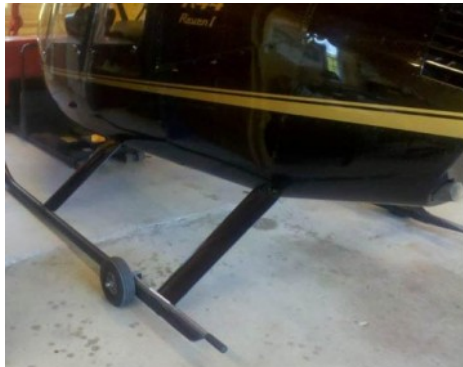
Residential Helicopter Hangar Floor - Before Application