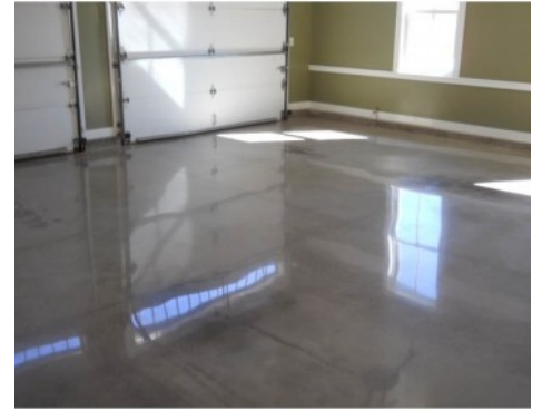
Residential Garage Floor - Bomanite Patene Teres Concrete Dye