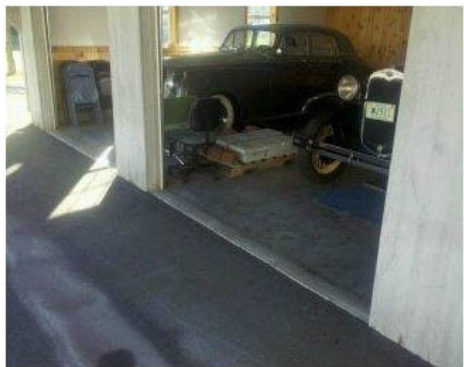
Residential Carriage House Floor - Before Application