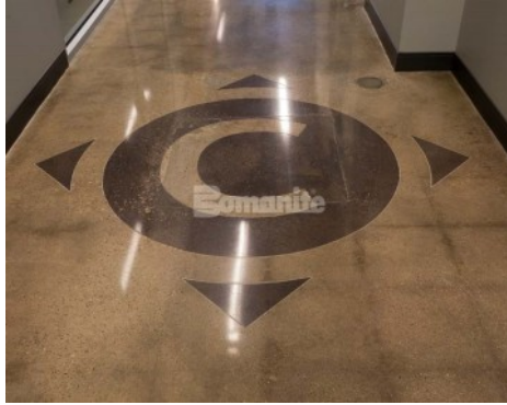
Compass Christian Church Center Facility - Bomanite Patene Teres Custom Polishing System with Black Orchid Concrete Dye