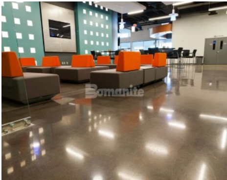
Compass Christian Church Center Facility - Bomanite Patene Teres Custom Polishing System with Black Orchid Concrete Dye