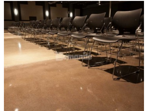
Compass Christian Church Center Facility - Bomanite Patene Teres Custom Polishing System with Black Orchid Concrete Dye