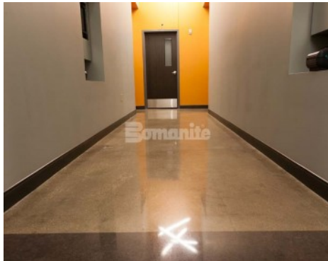
Compass Christian Church Center Facility - Bomanite Patene Teres Custom Polishing System with Black Orchid Concrete Dye