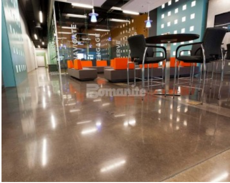
Compass Christian Church Center Facility - Bomanite Patene Teres Custom Polishing System with Black Orchid Concrete Dye