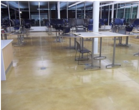
Upper Iowa University Student Center - Bomanite Polished Concrete Floor