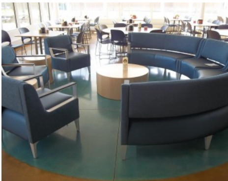
Upper Iowa University Student Center - Bomanite Polished Concrete Floor with Concrete Dye