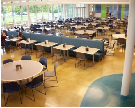
Upper Iowa University Student Center - Bomanite Polished Concrete Floor with Concrete Dye