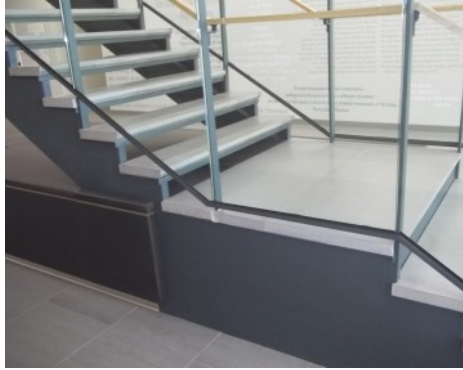
Upper Iowa University Student Center - Bomanite Polished Concrete Stairs