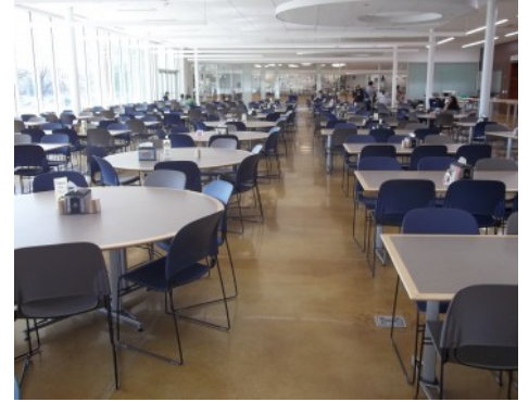
Upper Iowa University Student Center - Bomanite Polished Concrete Floor