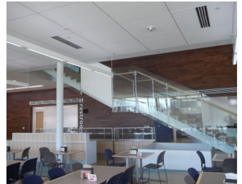
Upper Iowa University Student Center - Bomanite Polished Concrete Stairs