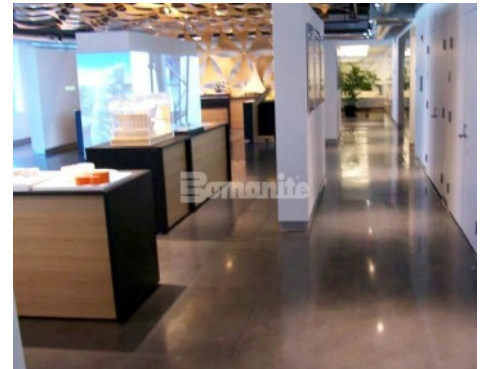
Autodesk AEC Office - Bomanite Custom Polishing Patène Teres Custom Mix Concrete Dye System