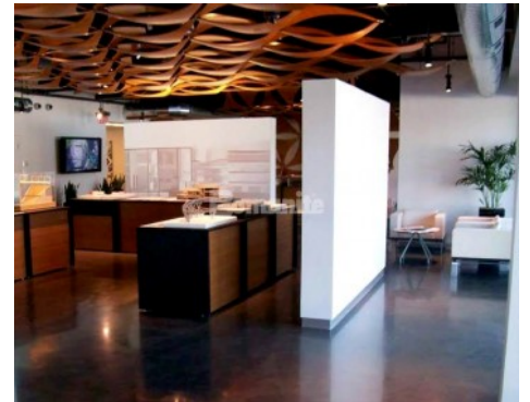
Autodesk AEC Office - Bomanite Custom Polishing Patène Teres Custom Mix Concrete Dye System