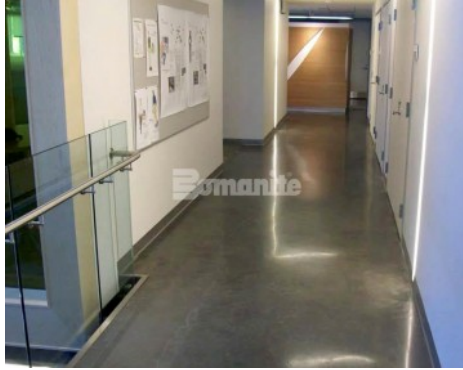
Autodesk AEC Office - Bomanite Custom Polishing Patène Teres Custom Mix Concrete Dye System