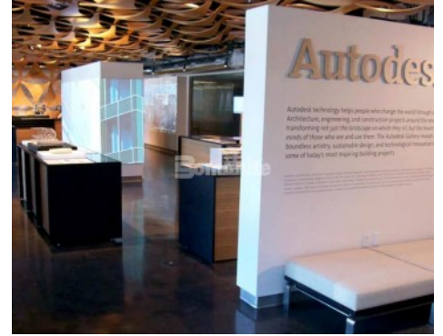
Autodesk AEC Office - Bomanite Custom Polishing Patène Teres Custom Mix Concrete Dye System