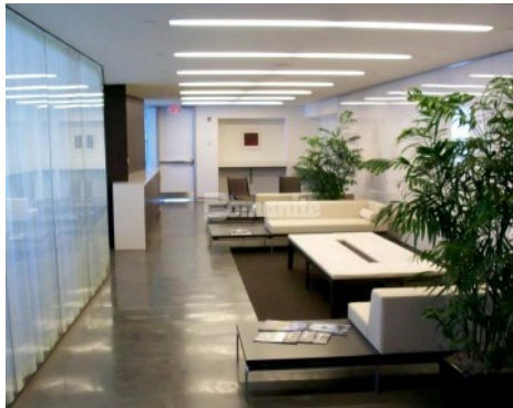
Autodesk AEC Office - Bomanite Custom Polishing Patène Teres Custom Mix Concrete Dye System