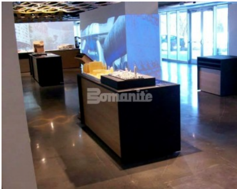
Autodesk AEC Office - Bomanite Custom Polishing Patène Teres Custom Mix Concrete Dye System