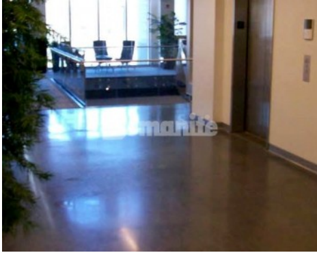
Autodesk AEC Office - Bomanite Custom Polishing Patène Teres Custom Mix Concrete Dye System