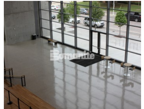
Dallas City Performance Hall - Bomanite Custom Polishing VitraFlor System Interior Floor