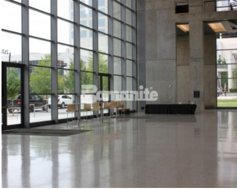
Dallas City Performance Hall - Bomanite Custom Polishing VitraFlor System Interior Floor