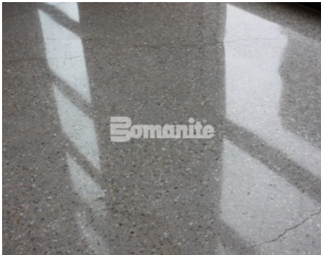
Dallas City Performance Hall - Bomanite Custom Polishing VitraFlor System Interior Floor