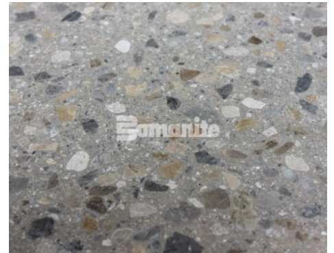
Dallas City Performance Hall - Bomanite Custom Polishing VitraFlor System Interior Floor