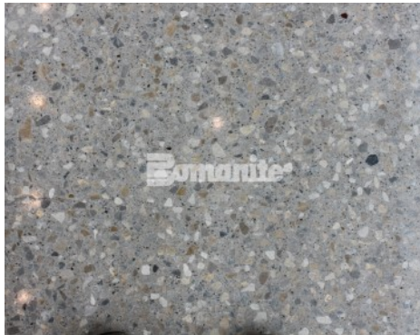
Dallas City Performance Hall - Bomanite Custom Polishing VitraFlor System Interior Floor