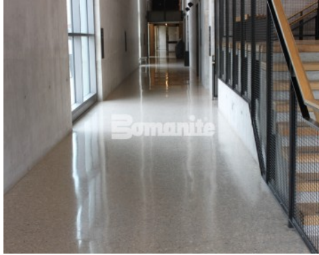
Dallas City Performance Hall - Bomanite Custom Polishing VitraFlor System Interior Floor