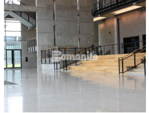
Dallas City Performance Hall - Bomanite Custom Polishing VitraFlor System Interior Floor