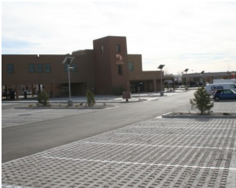
Los Alamos National Bank - Stone Filled Grasscrete