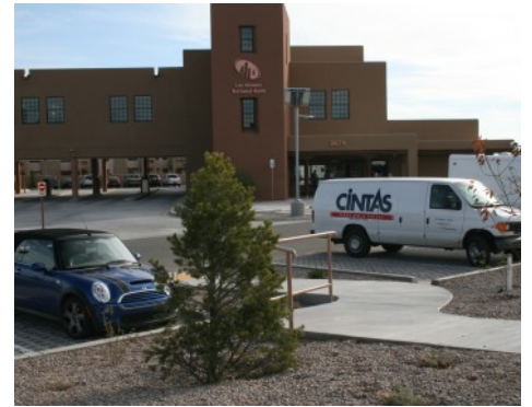
Los Alamos National Bank - Stone Filled Grasscrete