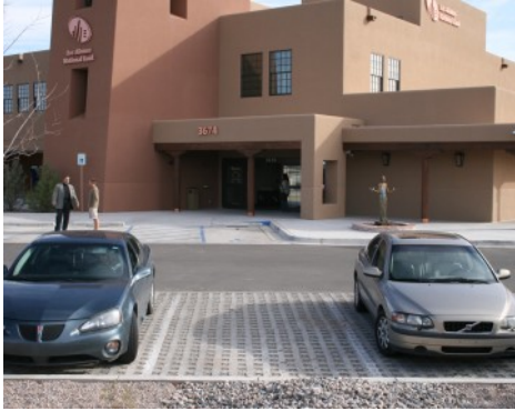
Los Alamos National Bank - Stone Filled Grasscrete