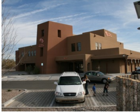
Los Alamos National Bank - Stone Filled Grasscrete