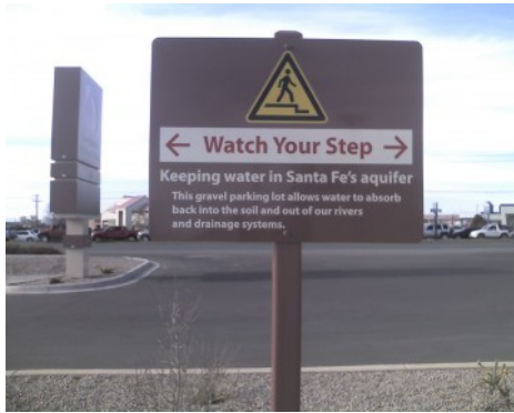
Los Alamos National Bank - Stone Filled Grasscrete