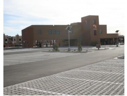
Los Alamos National Bank - Stone Filled Grasscrete