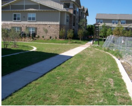
Woodlands of College Station - Grasscrete Concealed System