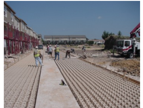
Woodlands of College Station - Molded Pulp Former Installation