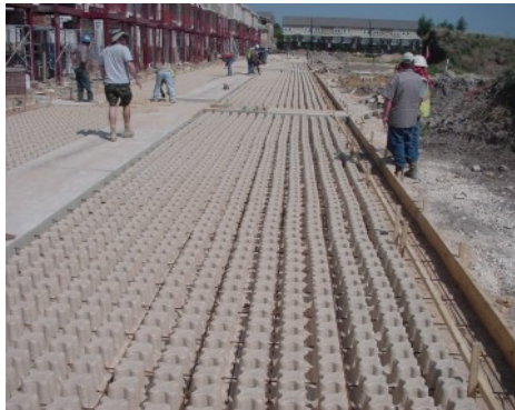
Woodlands of College Station - Molded Pulp Former Installation