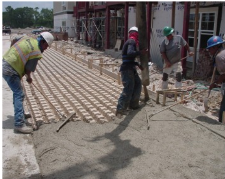
Woodlands of College Station - Concrete Pour