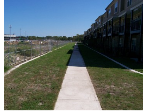
Woodlands of College Station - Grasscrete Concealed System - Early Growth