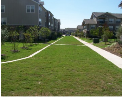
Woodlands of College Station - Grasscrete Concealed System