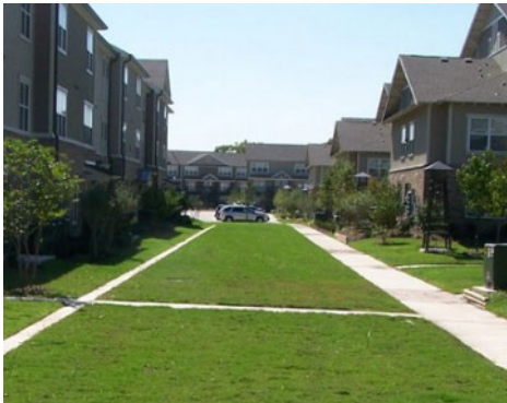
Woodlands of College Station - Grasscrete Concealed System