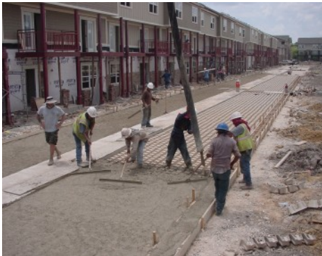
Woodlands of College Station - Concrete Pour