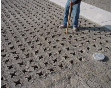
Woodlands of College Station - Opening Molded Pulp Former Voids