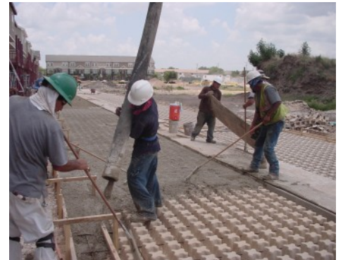
Woodlands of College Station - Concrete Pour