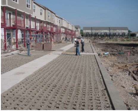
Woodlands of College Station - Opening Molded Pulp Former Voids