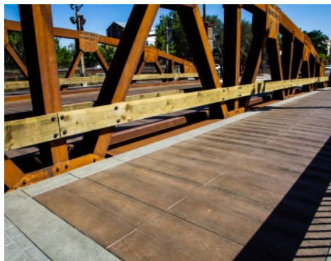
Temecula Bridge - Bomanite Imprint Systems Boardwalk Pattern