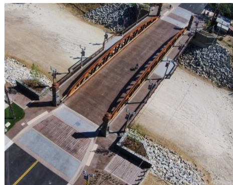
Temecula Bridge Overview - Bomanite Imprint Systems