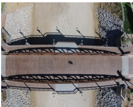
Temecula Bridge Overview - Bomanite Imprint Systems