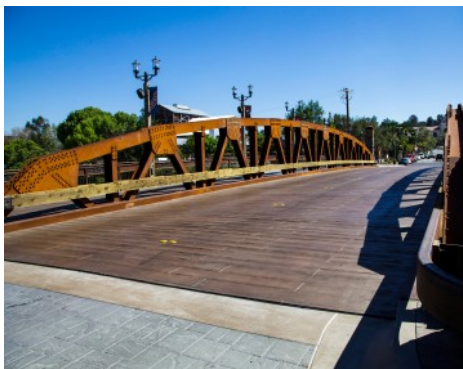
Temecula Bridge - Bomanite Imprint Systems Boardwalk and Ashlar Slate Patterns