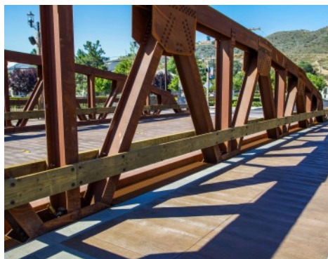
Temecula Bridge - Bomanite Imprint Systems Boardwalk Pattern