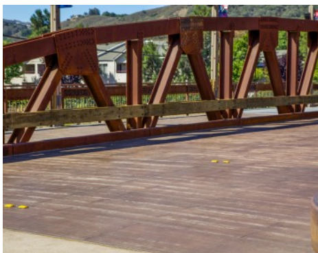
Temecula Bridge - Bomanite Imprint Systems Boardwalk Pattern