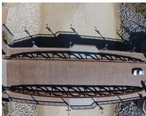
Temecula Bridge Overview - Bomanite Imprint Systems