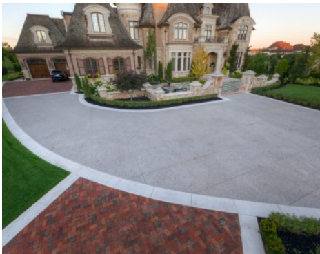
Residential Driveway - Bomanite Sandstone Texture