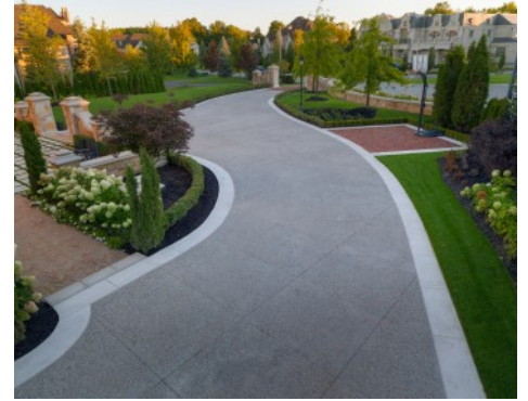
Residential Driveway - Bomanite Sandstone Texture