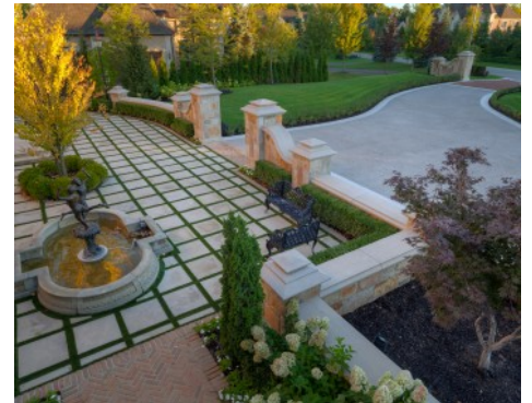
Residential Driveway - Bomanite Sandstone Texture