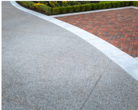
Residential Driveway - Bomanite Sandstone Texture