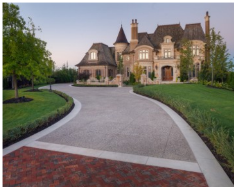
Residential Driveway - Bomanite Sandstone Texture