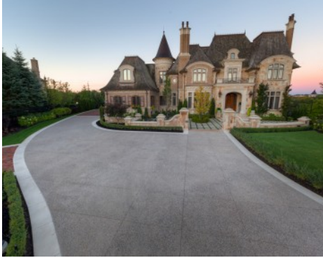
Residential Driveway - Bomanite Sandstone Texture