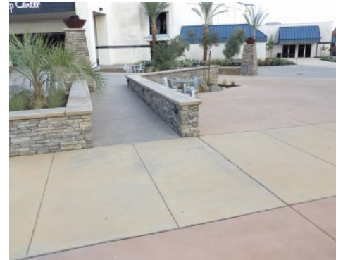
Northside Christian Church - Sandscape Texture