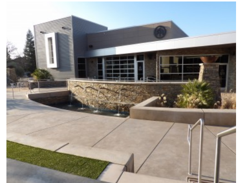
Northside Christian Church - Sandscape Refined Antico