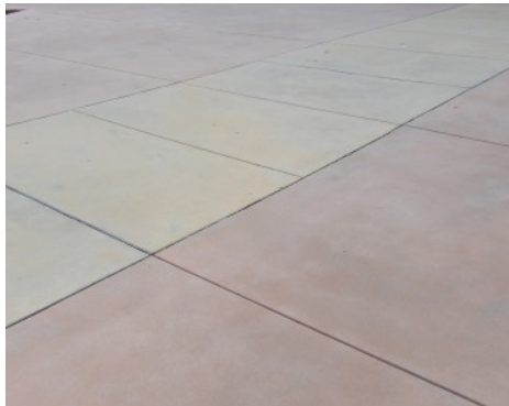
Northside Christian Church - Sandscape Texture