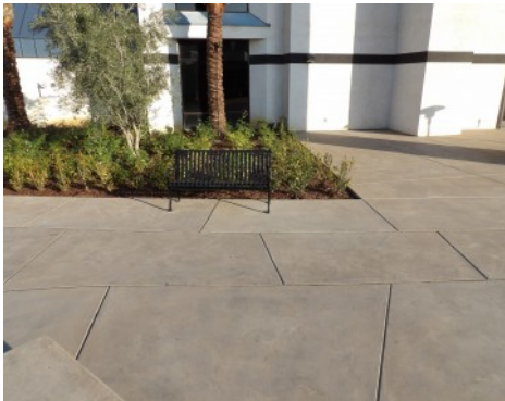
Northside Christian Church - Sandscape Refined Antico