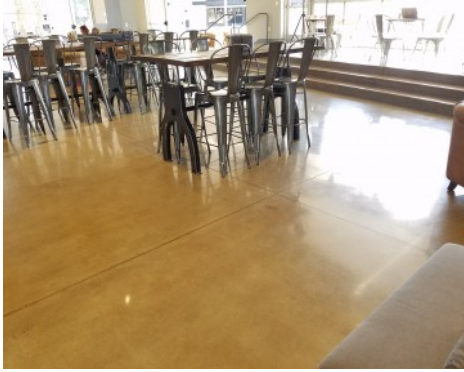
Northside Christian Church Coffee House - Custom Polishing System Patene Teres