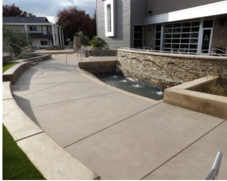
Northside Christian Church - Sandscape Refined Antico