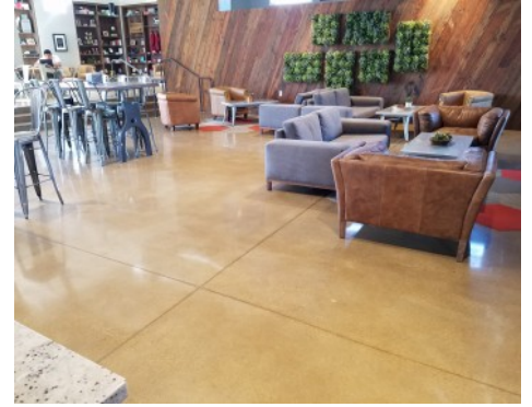
Northside Christian Church Coffee House - Custom Polishing System Patene Teres