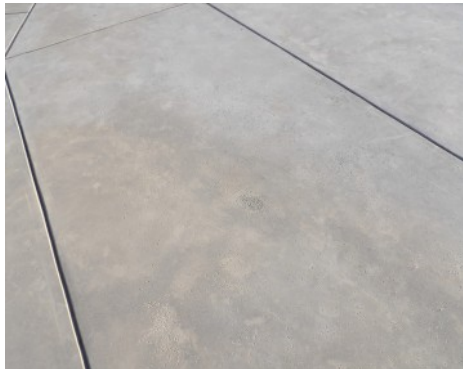
Northside Christian Church - Sandscape Refined Antico