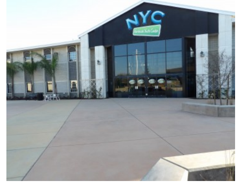
Northside Christian Church - Sandscape Texture