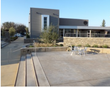
Northside Christian Church - Sandscape Refined Antico