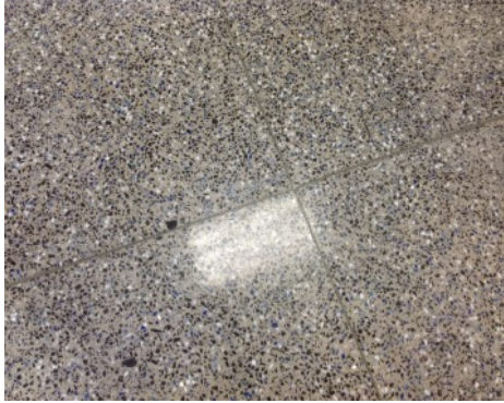
Modena by Bomanite Polished Concrete - Partyka Car Dealership using Modena Monolithic System