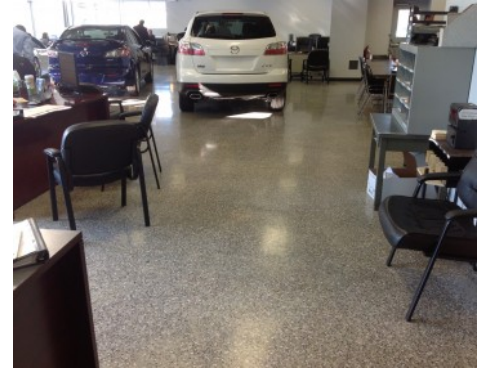
Modena by Bomanite Polished Concrete - Partyka Car Dealership using Modena Monolithic System