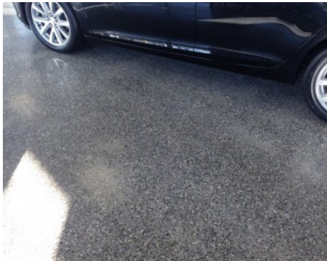
Modena by Bomanite Polished Concrete - Partyka Car Dealership using Modena Monolithic System