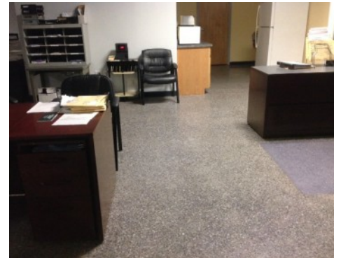
Modena by Bomanite Polished Concrete - Partyka Car Dealership using Modena Monolithic System