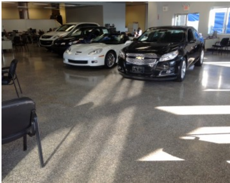
Modena by Bomanite Polished Concrete - Partyka Car Dealership using Modena Monolithic System