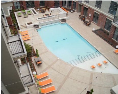
Hartford Commons The Edge Apartments - Bomanite Exposed Aggregate Alloy System Pool Deck