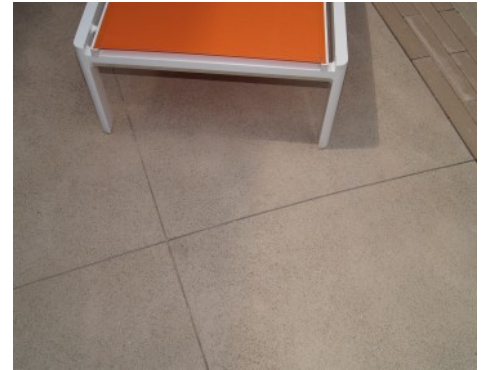
Hartford Commons The Edge Apartments - Bomanite Exposed Aggregate Alloy System Pool Deck