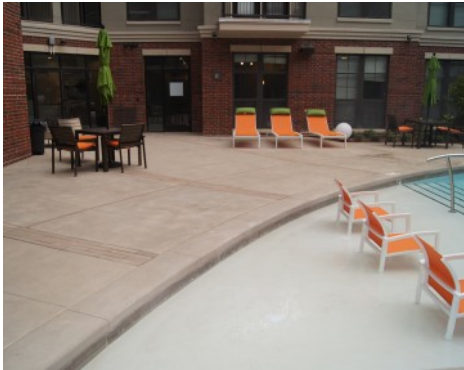
Hartford Commons The Edge Apartments - Bomanite Exposed Aggregate Alloy System Pool Deck