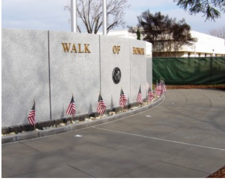
Veterans Walk of Honor - Bomanite Exposed Aggregate Sandscape Texture