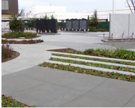
Veterans Walk of Honor - Bomanite Exposed Aggregate Sandscape Texture