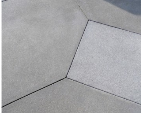
Veterans Walk of Honor - Bomanite Exposed Aggregate SandScape Texture - Close Up