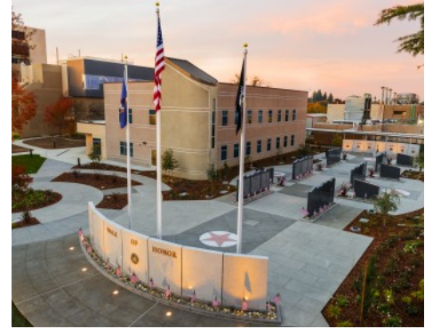
Veterans Walk of Honor - Bomanite Exposed Aggregate Sandscape Texture