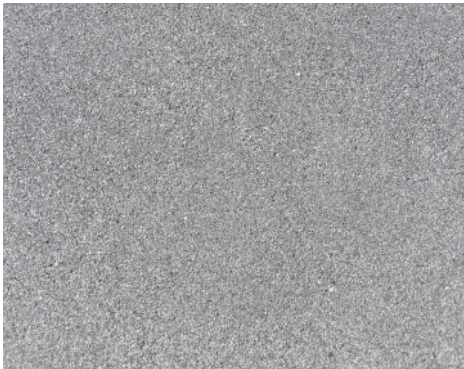
Veterans Walk of Honor - Bomanite Exposed Aggregate Sandscape Texture - Close Up