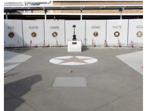
Veterans Walk of Honor - Bomanite Exposed Aggregate Sandscape Texture