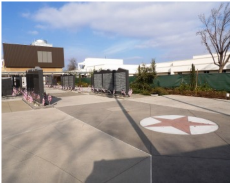
Veterans Walk of Honor - Bomanite Exposed Aggregate Sandscape Texture