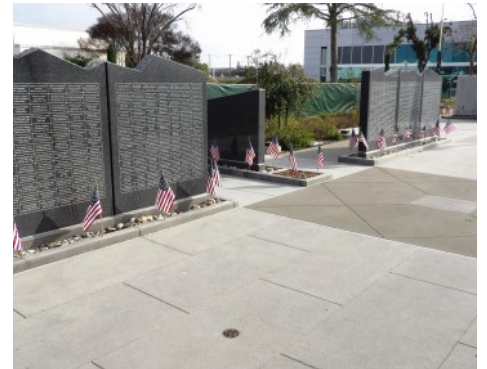
Veterans Walk of Honor - Bomanite Exposed Aggregate Sandscape Texture