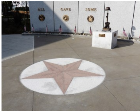
Veterans Walk of Honor - Bomanite Exposed Aggregate Sandscape Texture