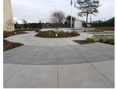
Veterans Walk of Honor - Bomanite Exposed Aggregate SandScape Texture