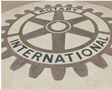
Mesquite Rotary Club Grove of Honor Memorial - Bomanite Imprint Systems Running Bond Used Brick Walkway with Exposed Aggregate Sandstone Refined System Logo