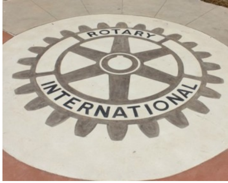
Mesquite Rotary Club Grove of Honor Memorial - Bomanite Imprint Systems Running Bond Used Brick Walkway with Exposed Aggregate Sandstone Refined System Logo