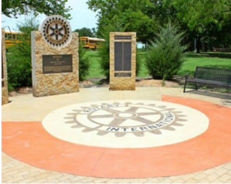
Mesquite Rotary Club Grove of Honor Memorial - Bomanite Imprint Systems Running Bond Used Brick Walkway with Exposed Aggregate Sandstone Refined System Logo