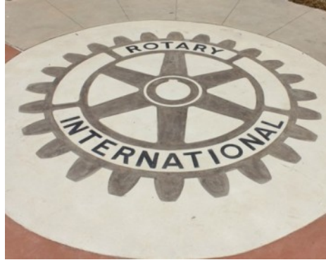
Mesquite Rotary Club Grove of Honor Memorial - Bomanite Imprint Systems Running Bond Used Brick Walkway with Exposed Aggregate Sandstone Refined System Logo