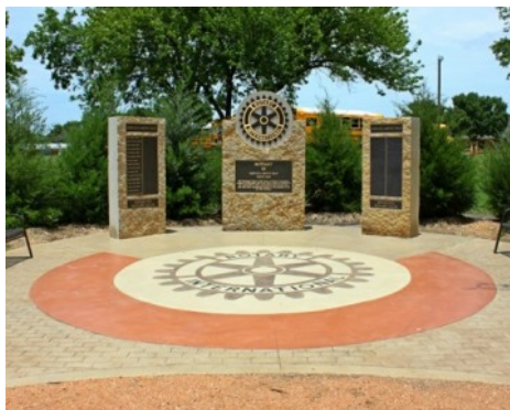
Mesquite Rotary Club Grove of Honor Memorial - Bomanite Imprint Systems Running Bond Used Brick Walkway with Exposed Aggregate Sandstone Refined System Logo