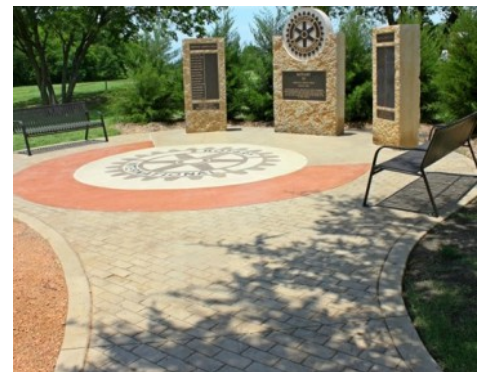
Mesquite Rotary Club Grove of Honor Memorial - Bomanite Imprint Systems Running Bond Used Brick Walkway with Exposed Aggregate Sandstone Refined System Logo