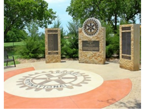
Mesquite Rotary Club Grove of Honor Memorial - Bomanite Imprint Systems Running Bond Used Brick Walkway with Exposed Aggregate Sandstone Refined System Logo