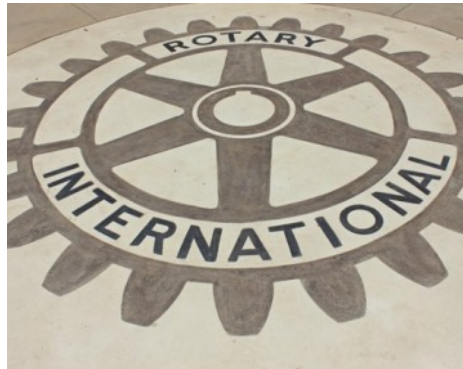
Mesquite Rotary Club Grove of Honor Memorial - Bomanite Imprint Systems Running Bond Used Brick Walkway with Exposed Aggregate Sandstone Refined System Logo