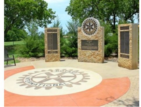
Mesquite Rotary Club Grove of Honor Memorial - Bomanite Imprint Systems Running Bond Used Brick Walkway with Exposed Aggregate Sandstone Refined System Logo