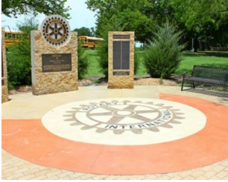
Mesquite Rotary Club Grove of Honor Memorial - Bomanite Imprint Systems Running Bond Used Brick Walkway with Exposed Aggregate Sandstone Refined System Logo