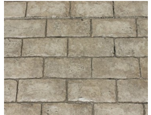
Mesquite Rotary Club Grove of Honor Memorial - Bomanite Imprint Systems Running Bond Used Brick Walkway (close up) with Exposed Aggregate Sandstone Refined System Logo