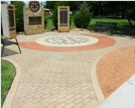
Mesquite Rotary Club Grove of Honor Memorial - Bomanite Imprint Systems Running Bond Used Brick Walkway with Exposed Aggregate Sandstone Refined System Logo