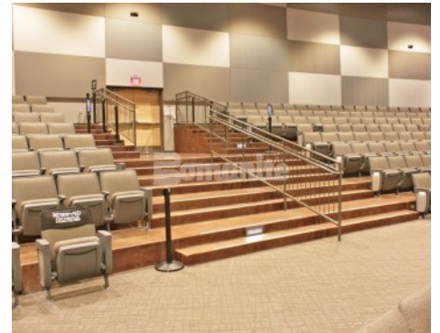
Hope Fellowship Church - Bomanite Custom Polishing Patene Teres System Auditorium