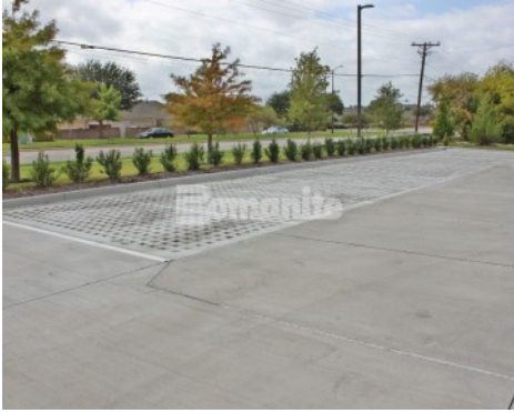
Hope Fellowship Church - Parking Lot - Bomanite Pervious Grasscrete Stone Filled System