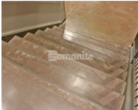
Hope Fellowship Church - Bomanite Custom Polishing Patene Teres System Interior Floor