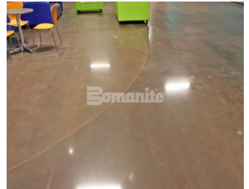
Hope Fellowship Church - Bomanite Custom Polishing Patene Teres System Interior Floor