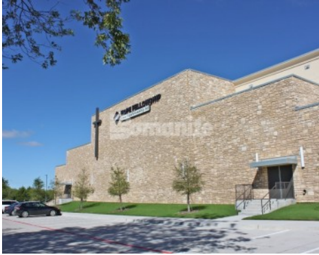
Hope Fellowship Church - Bomanite Custom Polishing Patene Teres System and Pervious Grasscrete Parking Lot