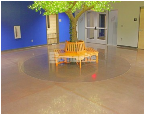
Hope Fellowship Church - Bomanite Custom Polishing Patene Teres System Interior Floor