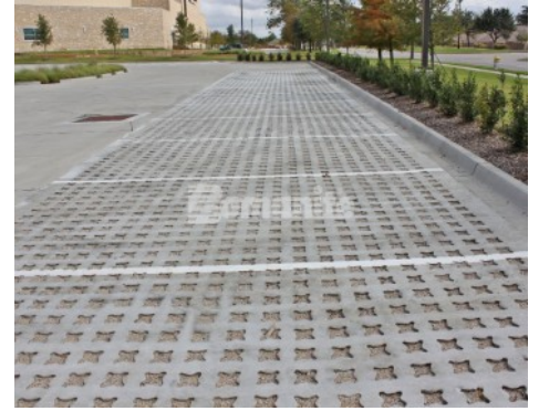
Hope Fellowship Church - Parking Lot - Bomanite Pervious Grasscrete Stone Filled System