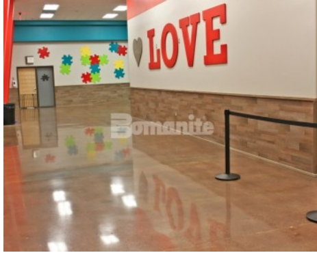
Hope Fellowship Church - Bomanite Custom Polishing Patene Teres System Interior Floor