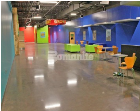
Hope Fellowship Church - Bomanite Custom Polishing Patene Teres System Interior Floor