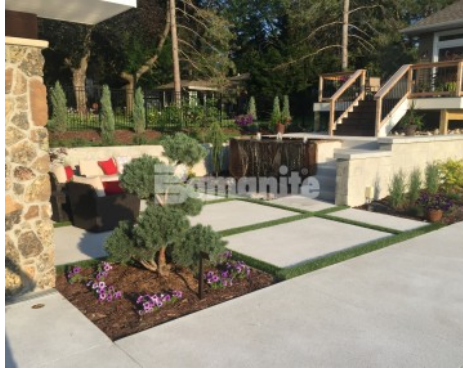
Residential Patio and Stairs - Bomanite Exposed Aggregate Revealed. Wall Caps - Bomanite Exposed Aggregate Antico Process