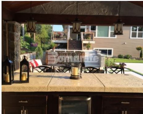
Residential Cabana Concrete Countertop - Bomanite Color Hardener