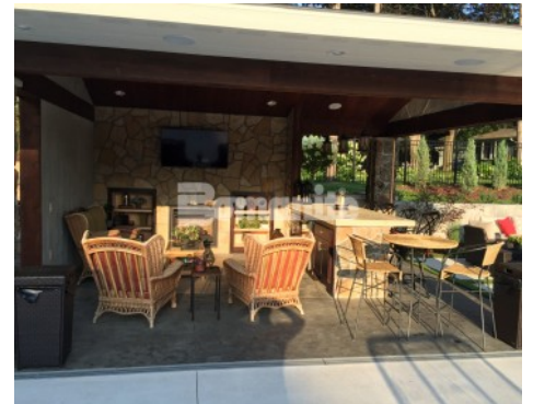
Residential Backyard Cabana Floor - Bomanite Imprint Systems Slate Texture Pattern