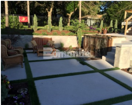
Residential Patio and Stairs - Bomanite Exposed Aggregate Revealed. Wall Caps - Bomanite Exposed Aggregate Antico Process