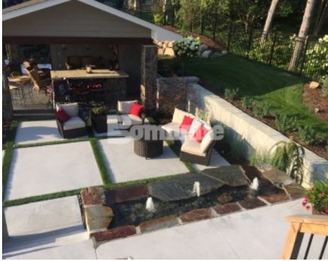
Residential Patio and Stairs - Bomanite Exposed Aggregate Revealed.