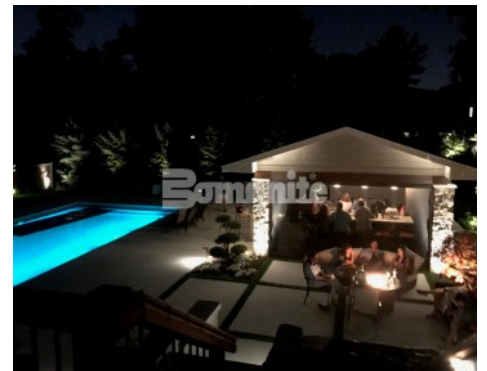
Residential Backyard Resort - Bomanite Revealed Exposed Aggregate Systems