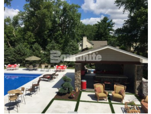
Residential Pool Deck - Bomanite Revealed Exposed Aggregate System