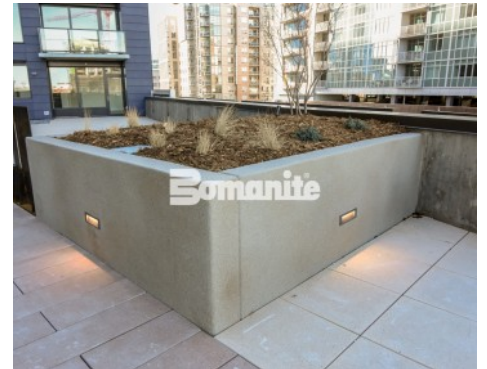
The Coloradan Planter Walls - Bomanite Toppings Systems Micro-Top ST