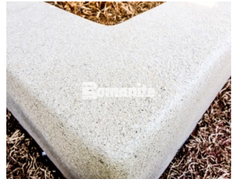
The Coloradan Planter Walls - Bomanite Toppings Systems Micro-Top ST