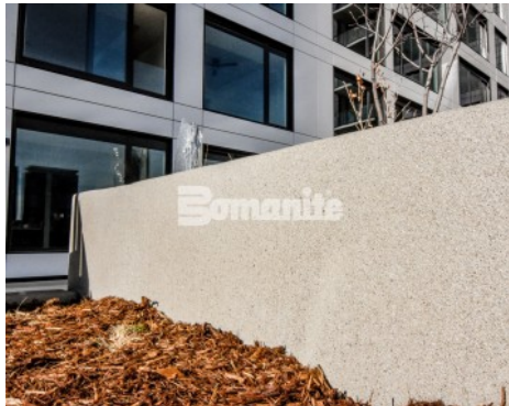
The Coloradan Planter Walls - Bomanite Toppings Systems Micro-Top ST