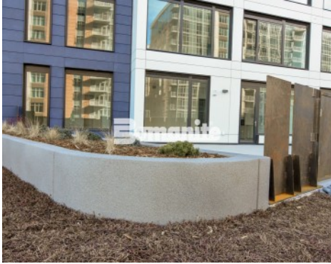
The Coloradan Planter Walls - Bomanite Toppings Systems Micro-Top ST