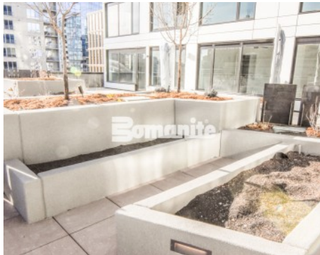
The Coloradan Planter Walls - Bomanite Toppings Systems Micro-Top ST