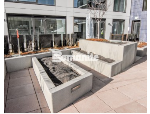
The Coloradan Planter Walls - Bomanite Toppings Systems Micro-Top ST