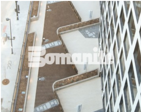
The Coloradan Planter Walls - Bomanite Toppings Systems Micro-Top ST