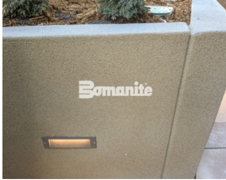
The Coloradan Planter Walls - Bomanite Toppings Systems Micro-Top ST