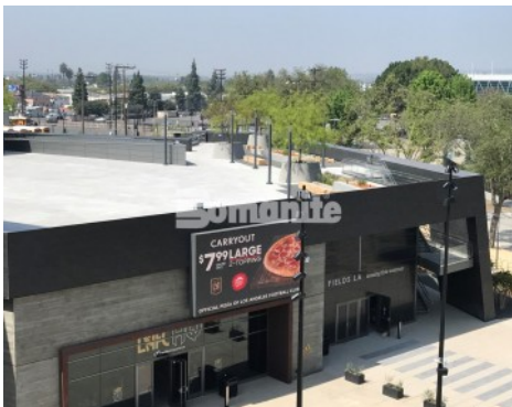
Banc of California LAFC Stadium - Bomanite Exposed Aggregate Systems Sandstone Texture Plaza, Roof Top Planters and Bomanite Imprint Systems Boardwalk to Restaurant