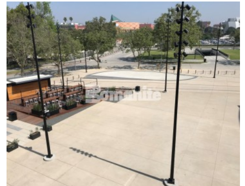
Banc of California LAFC Stadium - Bomanite Exposed Aggregate Systems Sandstone Texture Plaza and Flight Wall with Bomanite Imprint Systems