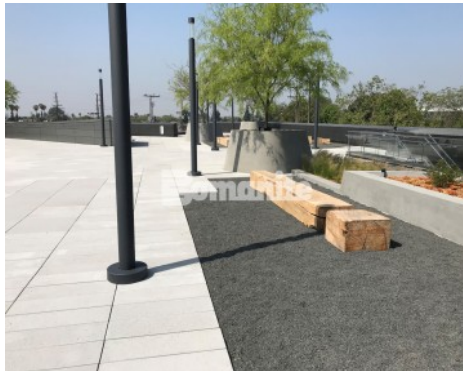
Banc of California LAFC Stadium - Bomanite Exposed Aggregate Systems Sandstone Texture Tree Planters and Lineal Planters