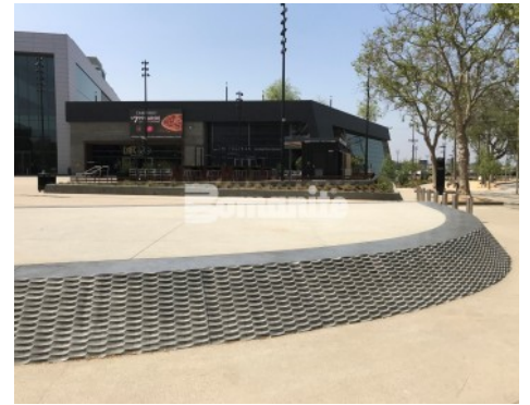
Banc of California LAFC Stadium - Bomanite Exposed Aggregate Systems SandScape Texture Plaza and Flight Wall with Integral Color