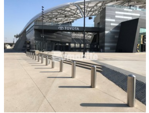
Banc of California LAFC Stadium - Bomanite Exposed Aggregate Systems Sandstone Texture Entry with Bands of Bomanite Alloy