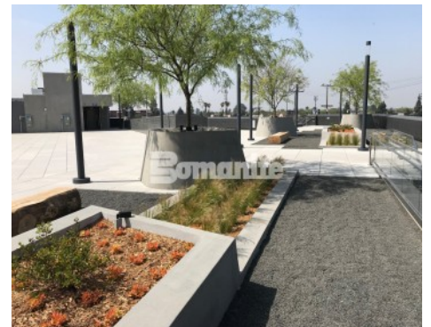
Banc of California LAFC Stadium - Bomanite Exposed Aggregate Systems Sandstone Texture Tree Planters and Lineal Planters