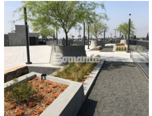
Banc of California LAFC Stadium - Bomanite Exposed Aggregate Systems SandScape Texture Tree Planters and Lineal Planters