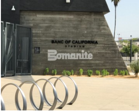
Banc of California LAFC Stadium - Bomanite Exposed Aggregate Systems Sandstone Texture Entry with Bands of Bomanite Alloy