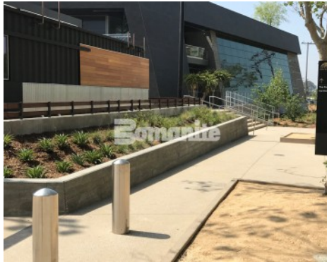
Banc of California LAFC Stadium - Bomanite Exposed Aggregate Systems Sandstone Texture Walkway