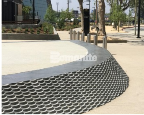
Banc of California LAFC Stadium - Bomanite Exposed Aggregate Systems Sandstone Texture Plaza and Flight Wall with Integral Color