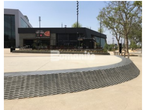
Banc of California LAFC Stadium - Bomanite Exposed Aggregate Systems Sandstone Texture Plaza and Flight Wall with Integral Color