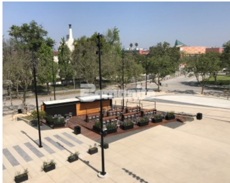
Banc of California LAFC Stadium - Bomanite Exposed Aggregate Systems Sandstone Texture Plaza and Flight Wall with Bomanite Imprint Systems