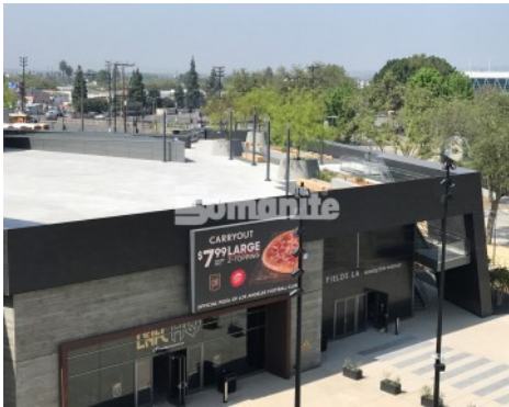
Banc of California LAFC Stadium - Bomanite Exposed Aggregate Systems SandScape Texture Plaza, Roof Top Planters and Bomanite Imprint Systems Boardwalk to Restaurant