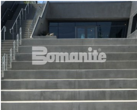
Banc of California LAFC Stadium - Bomanite Exposed Aggregate Systems Sandstone Texture Bench Seats