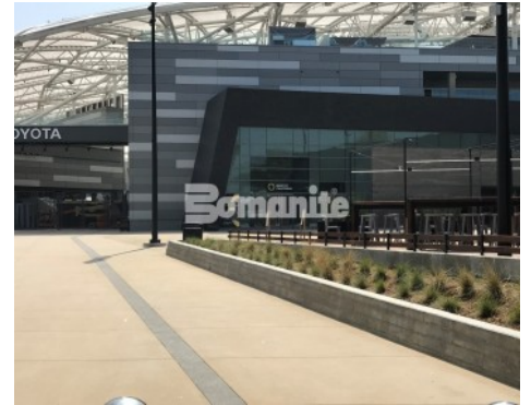
Banc of California LAFC Stadium - Bomanite Exposed Aggregate Systems Sandstone Texture Entry with Bands of Bomanite Alloy