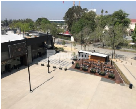
Banc of California LAFC Stadium - Bomanite Exposed Aggregate Systems SandScape Texture Plaza and Bomanite Imprint Systems Boardwalk to Restaurant