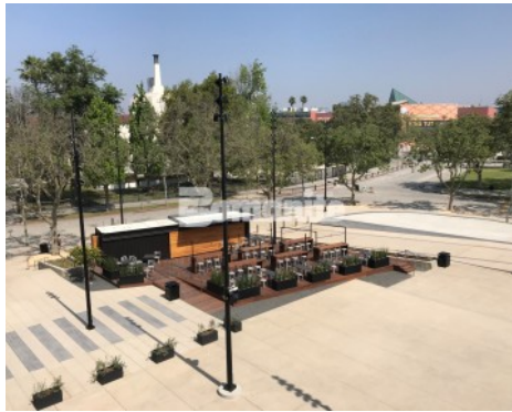
Banc of California LAFC Stadium - Bomanite Exposed Aggregate Systems SandScape Texture Plaza and Flight Wall with Bomanite Imprint Systems