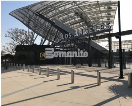
Banc of California LAFC Stadium - Bomanite Exposed Aggregate Systems Sandstone Texture Entry with Bands of Bomanite Alloy