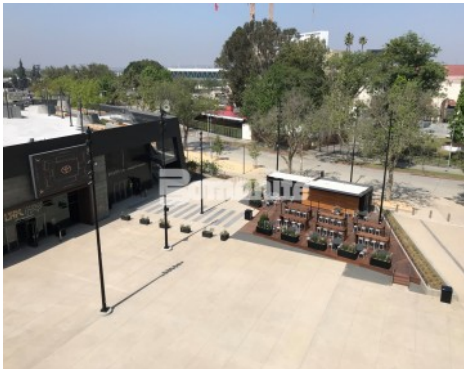
Banc of California LAFC Stadium - Bomanite Exposed Aggregate Systems Sandstone Texture Plaza and Bomanite Imprint Systems Boardwalk to Restaurant