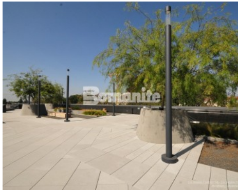
Banc of California LAFC Stadium - Bomanite Exposed Aggregate Systems SandScape Texture Tree Planters and Lineal Planters