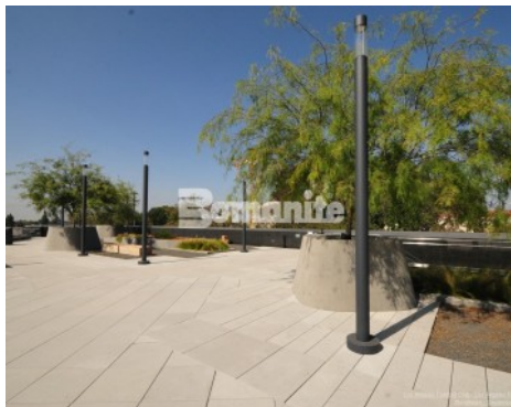
Banc of California LAFC Stadium - Bomanite Exposed Aggregate Systems Sandstone Texture Tree Planters and Lineal Planters