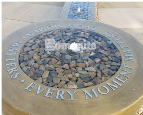
Clovis Community Medical Cancer Institute Water Fountain - Bomanite Coloration Systems Integral Color