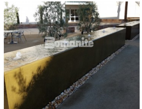
Clovis Community Medical Cancer Institute Water Fountain - Bomanite Coloration Systems Integral Color