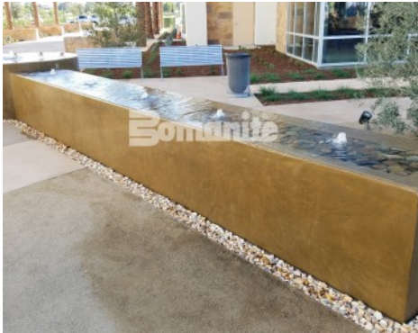
Clovis Community Medical Cancer Institute Water Fountain - Bomanite Coloration Systems Integral Color