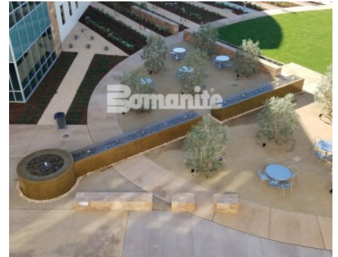
Clovis Community Medical Cancer Institute Water Fountain - Bomanite Coloration Systems Integral Color