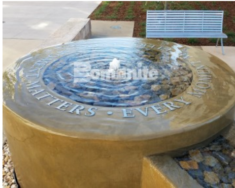
Clovis Community Medical Cancer Institute Water Fountain - Bomanite Coloration Systems Integral Color