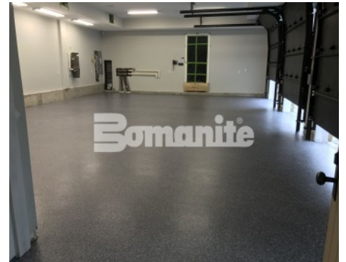
Essex County Estate - Bomanite Toppings Systems Broadcast Flake Garage Floor