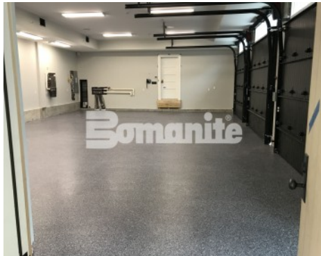
Essex County Estate - Bomanite Toppings Systems Broadcast Flake Garage Floor