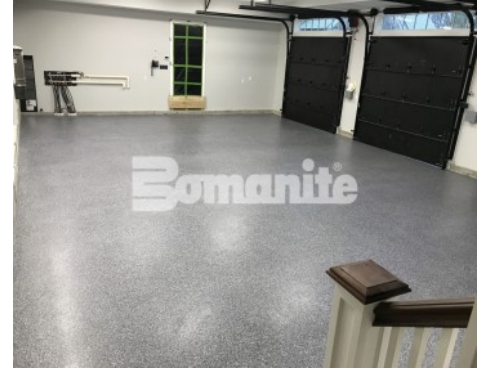
Essex County Estate - Bomanite Toppings Systems Broadcast Flake Garage Floor