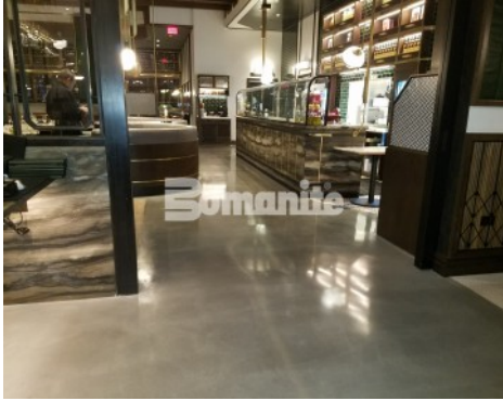
Angeline by Michael Symon - Bomanite Modena SL Custom Polished Concrete Interior Restaurant Floor

ANGELINE BY MICHAEL SYMON RESTAURANT (MODENA SL)