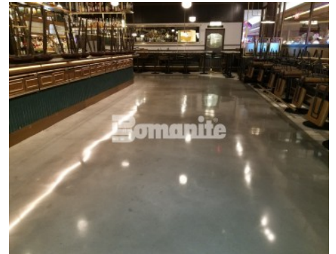
Angeline by Michael Symon - Bomanite Modena SL Custom Polished Concrete Interior Restaurant Floor