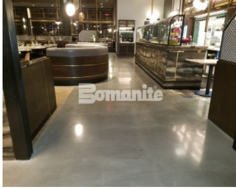
Angeline by Michael Symon - Bomanite Modena SL Custom Polished Concrete Interior Restaurant Floor