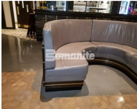
Angeline by Michael Symon - Bomanite Modena SL Custom Polished Concrete Interior Restaurant Floor