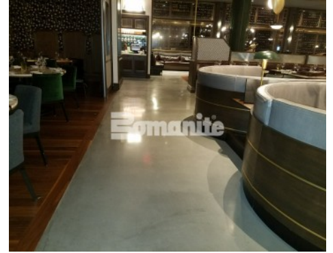
Angeline by Michael Symon - Bomanite Modena SL Custom Polished Concrete Interior Restaurant Floor