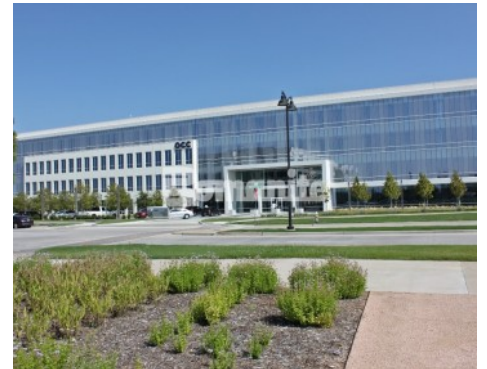
Cypress Waters Building - Bomanite VitraFlor Custom Polished Interior Floor