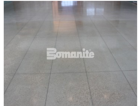
Cypress Waters Building - Bomanite VitraFlor Custom Polished Interior Floor