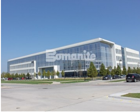
Cypress Waters Building - Bomanite VitraFlor Custom Polished Interior Floor