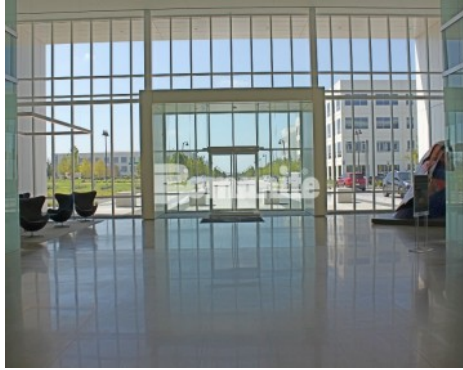
Cypress Waters Building - Bomanite VitraFlor Custom Polished Interior Floor