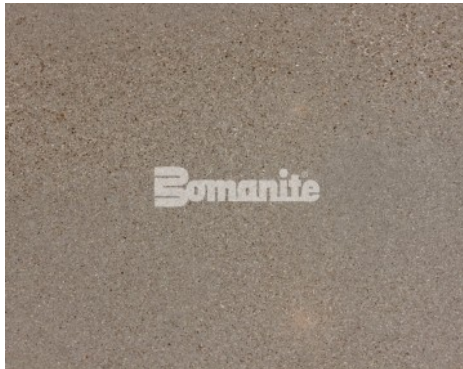
Cypress Waters Building - Bomanite VitraFlor Custom Polished Interior Floor