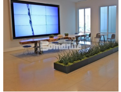
Cypress Waters Building - Bomanite VitraFlor Custom Polished Interior Floor