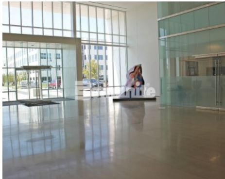
Cypress Waters Building - Bomanite VitraFlor Custom Polished Interior Floor