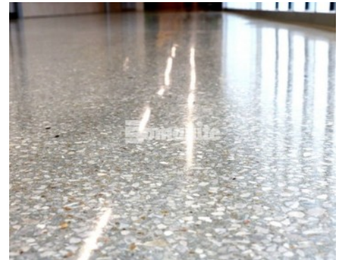
Olathe West High School - Bomanite Renaissance Custom Polishing System Interior Floor