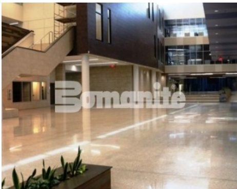
Olathe West High School - Bomanite Renaissance Custom Polishing System Interior Floor