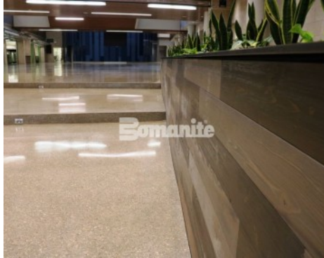
Olathe West High School - Bomanite Renaissance Custom Polishing System Interior Floor