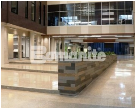
Olathe West High School - Bomanite Renaissance Custom Polishing System Interior Floor