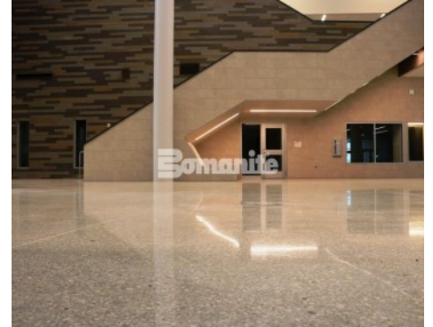
Olathe West High School - Bomanite Renaissance Custom Polishing System Interior Floor