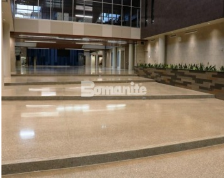
Olathe West High School - Bomanite Renaissance Custom Polishing System Interior Floor