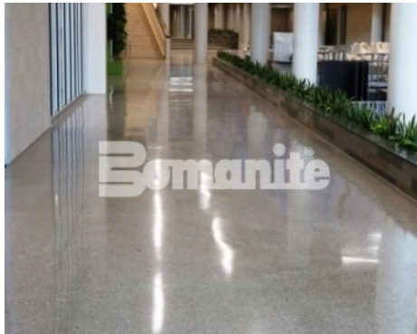
Olathe West High School - Bomanite Renaissance Custom Polishing System Interior Floor