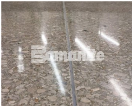
Olathe West High School - Bomanite Renaissance Custom Polishing System Interior Floor