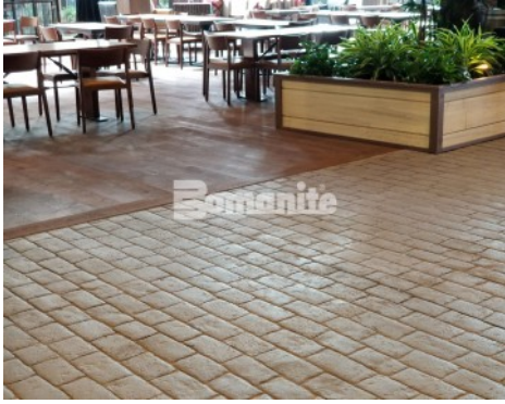
Gaylord Rockies Resort Colorado - Bomanite Imprint Systems