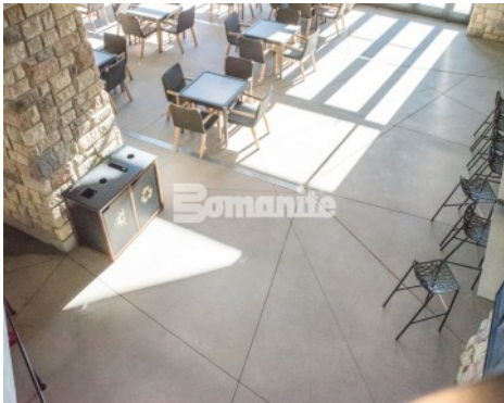
Gaylord Rockies Resort Colorado - Bomanite Exposed Aggregate Sandstone Texture Restaurant Floor