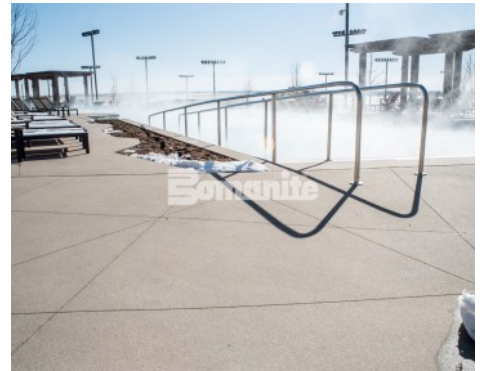
Gaylord Rockies Resort Colorado - Bomanite Exposed Aggregate Sandstone Texture Pool Deck