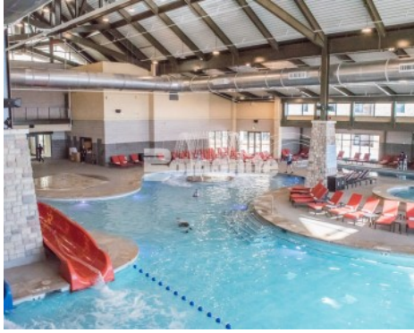
Gaylord Rockies Resort Colorado - Bomanite Exposed Aggregate Sandstone Texture Pool Deck