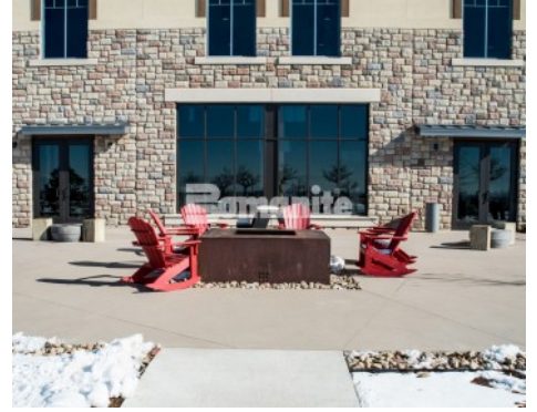
Gaylord Rockies Resort Colorado - Bomanite Exposed Aggregate Sandstone Texture Patio