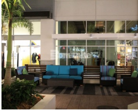
Tanger Outlets Daytona Beach - Bomanite Imprint Systems Bomacron Boardwalk Pattern Used in Lounge Area