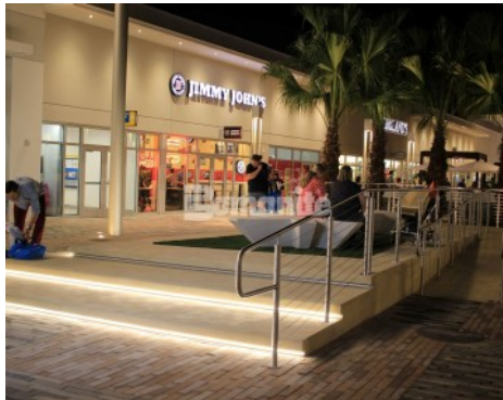
Tanger Outlets Daytona Beach - Bomanite Exposed Aggregate with Seashells Steps and Handicap Ramp