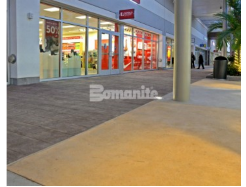
Tanger Outlets Daytona Beach - Bomanite Imprint Systems Bomacron Boardwalk Pattern Used in Store Front Walkway