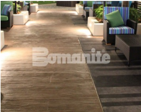
Tanger Outlets Daytona Beach - Bomanite Imprint Systems Bomacron Boardwalk Pattern Used in Lounge Area