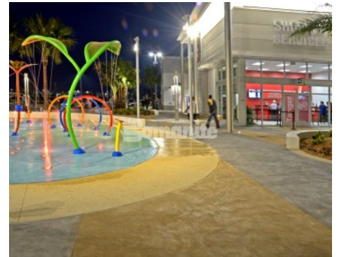
Tanger Outlets Daytona Beach - Colored Concrete Splash Pad Playground