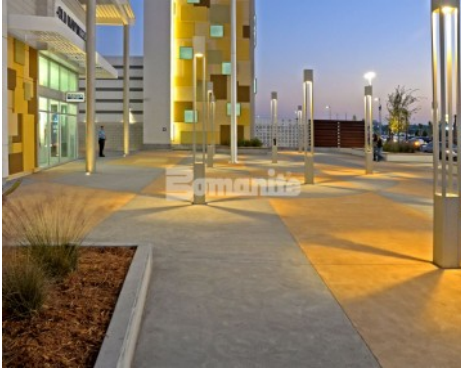
Tanger Outlets Daytona Beach - Two Tone Sponge Finish Concrete Color in Checkerboard Pattern